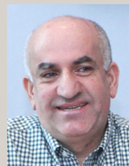
Bayram Balci Carnegie Endowment for International Peace