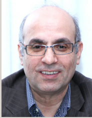
Hamid Ahmadi Institute for Middle East Strategic Studies