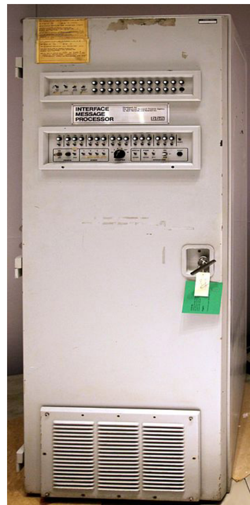
One of the many essential steps in the creation of what would become known as the internet occurred in 1968 when ARPA contracted BBN Technologies to build the first routers, known as Interface Message Processors or IMPs, which enabled ARPANET to become operational the following year.

University at the time and working on contract for DARPA, recalls that it took about six months of work to develop the right system architecture and create a rough protocol for controlling and managing the packet traffic. He and Robert Kahn, then