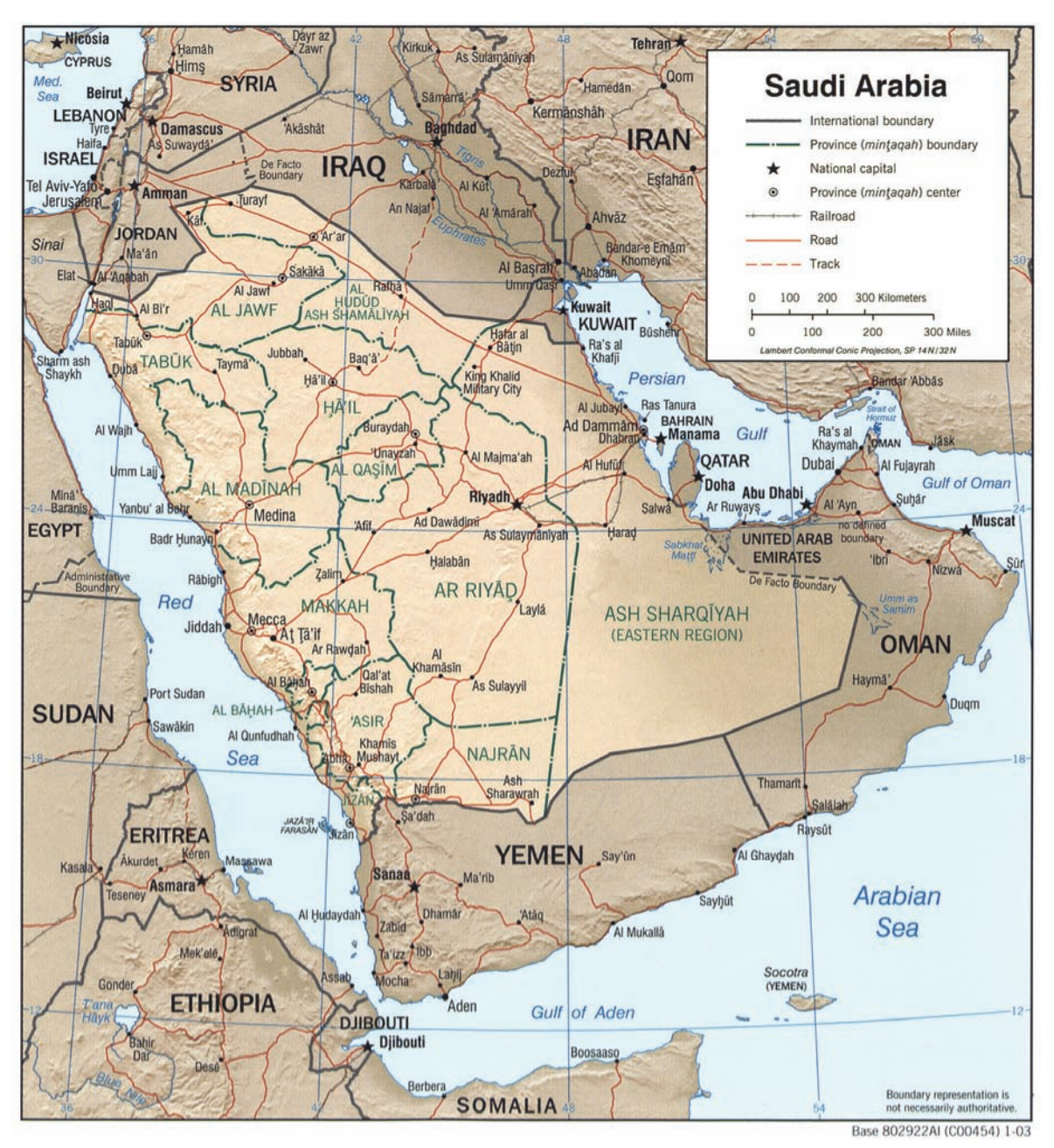
Map of Saudi Arabia.