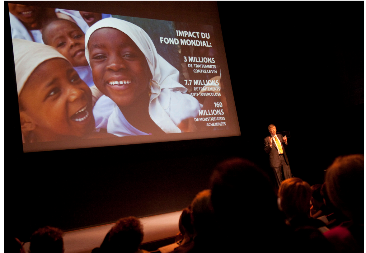
Figure 2 | Bill Gates speaks about the European investments in global health and development (here showing a slide of measures supported by the Global Fund) that are saving lives at Living Proof campaign event at the Museum Dapper. Paris, France. April 4, 2011.

Without a doubt, the Gates Foundation has been widely lauded for infusing cash and life into the global health field and encouraging participation of other players (see Figure 2) 13,115,116 . But even those who recognize this role decry the Foundation's lack of accountability and real-time transparency (over what are, after all, taxpayer-subsidized dollars) and the undue power of the BMGF and other private actors, including those encouraged under the Gates Foundation's