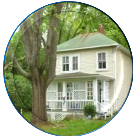
Goldsmith House, Trulia.com

Pride of Fairfax County Lodge #298 7809 Fordson Road, Alexandria Parcel Number: 1021 01 0098 Supervisory District: Mount Vernon