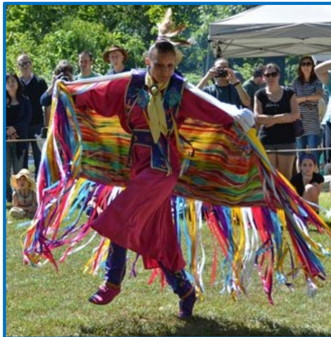
Riverbend Indian Festival, Fairfax County Park