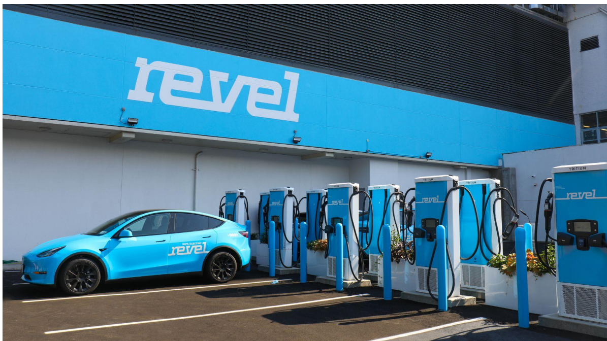
Revel's flagship Superhub in Bed-Stuy, Brooklyn.

Brooklyn, New York — Revel, a Brooklyn-based electric mobility and infrastructure company, announced today it is developing and opening five new electric vehicle (EV) fast charging Superhubs in New York City, adding 136 public charging stalls to New York's EV infrastructure landscape. Like Revel's flagship Superhub in Bed-Stuy, Brooklyn, the five new sites will be open 24/7 and accessible to any brand of EV. The sites will be equipped with ultrafast charging capable of charging an EV in 10-20 minutes.