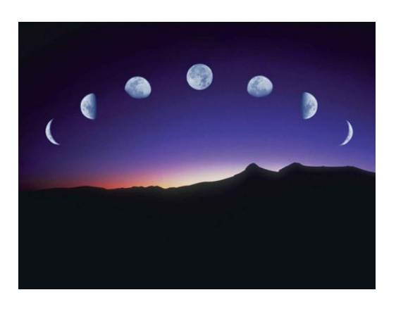
The Creator's designated system of time-keeping uses both the sun and the moon for tracking time.

And ... [Yahuwah] said, Let there be lights in the firmament of the heaven to divide the day from the night; and let them be for signs, and for seasons, and for days, and years: And let them be for lights in the firmament of the heaven to give light upon the earth: and it was so. And ... [Yahuwah] made two great lights; ... [And He] set them in the firmament of the heaven to give light upon the earth, And to rule over the day and over the night, and to divide the light from the darkness. (Genesis 1:14-18, KJV.)