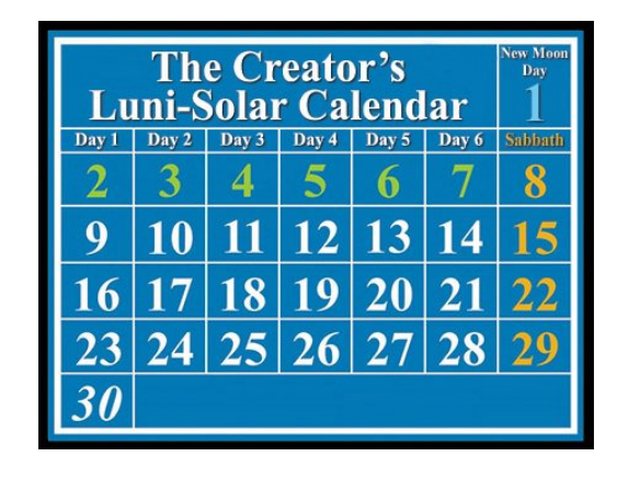
On the ancient calendar, the seventh-day Sabbath always falls on the same dates of every month.

The first day of the month on the luni-solar calendar is New Moon Day. (For use of the term "New Moon" in Scripture, see: I Samuel 20:5, 18 & 24; 2 Kings 4:23; Psalm 81:3; Isaiah 66:23; Ezekiel 46:1; and Amos 8:5.)