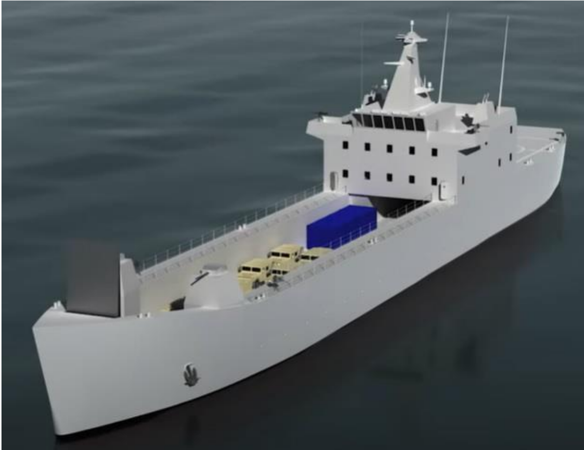
Figure 1. Navy Notional LSM Design Concept Computer rendering