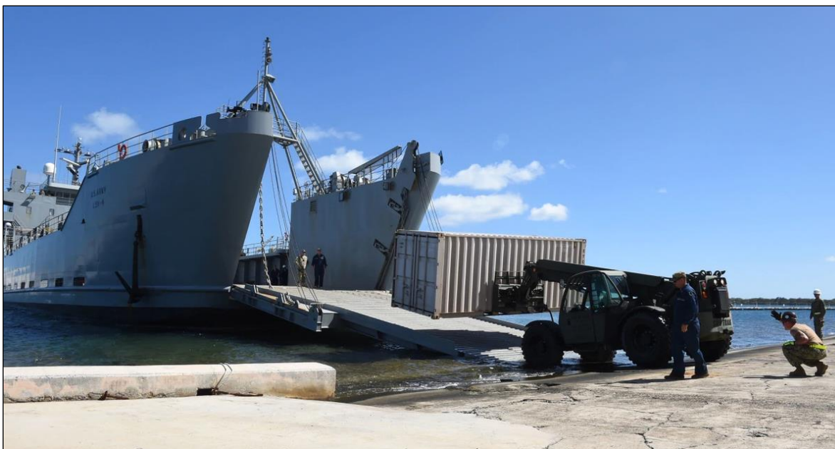
Figure 3. Besson-Class Logistics Support Vessel (LSV)