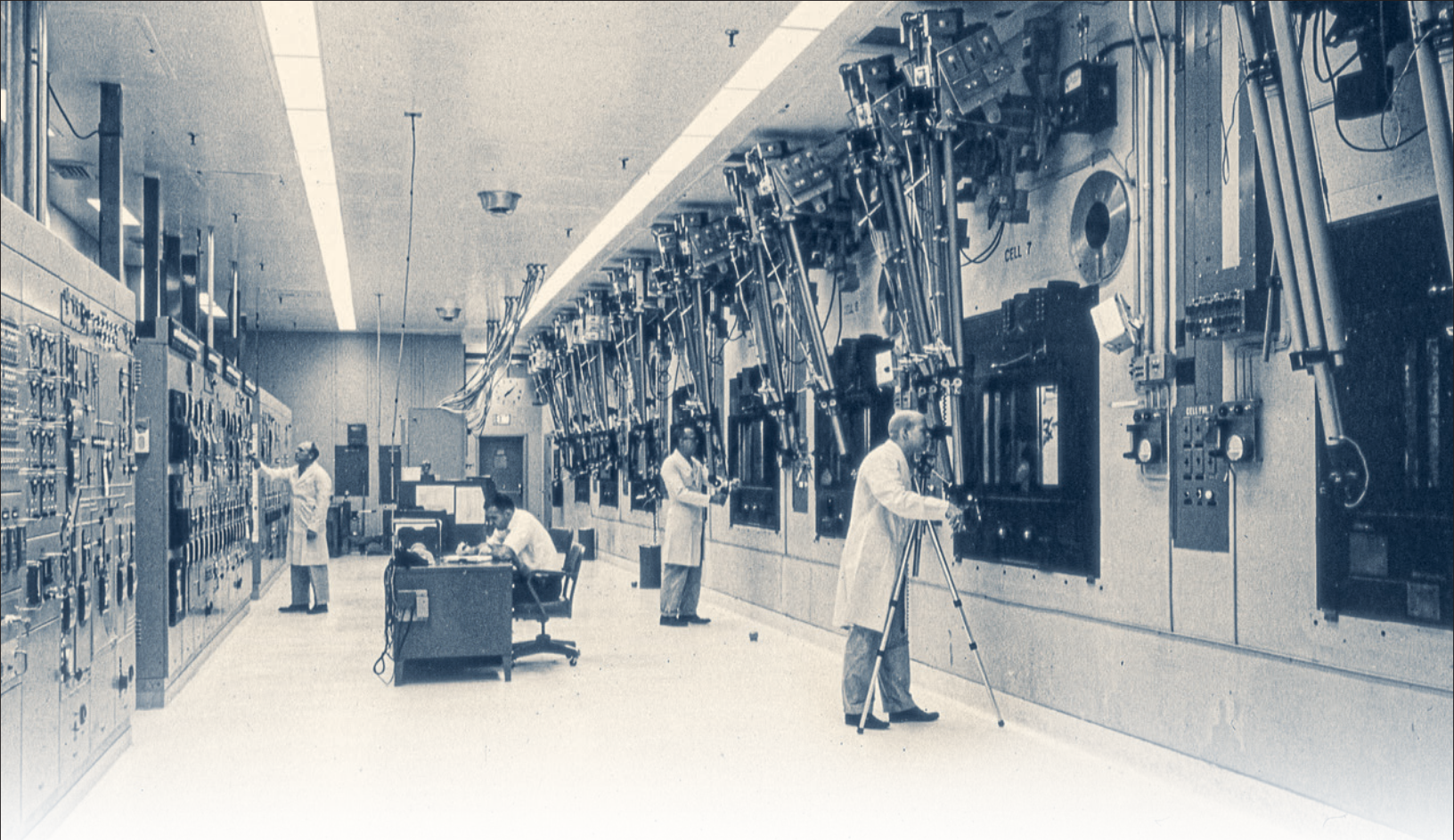
Scientists at Oak Ridge National Laboratory conduct research at a wall of Central Research-made telemanipulators. CRL became the international leader in the development of such instruments.

Red Wing, the small quantity of hazardous materials was to be used for research only.