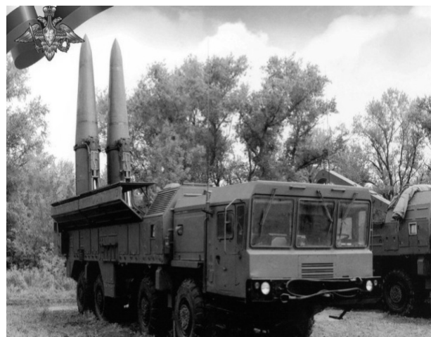
Image 1: Missile Complex 9K720, Missile 9M723 Iskander-M (SS-26). (Leonid Yakutin, Военно-Промышленный курьер , http://vpk-news.ru/photographs/gallery/384/ )

7 РИА Новости, "Искандер" поражает цель на расстоянии до 400 километров. Видеосучений , 20.10.2011 [ http://www.ria.ru/tv_defense_safety/20111020/465733453.html ] and Министерство обороны Российской Федерации, На полигоне, расположенном на территории Ленинградской