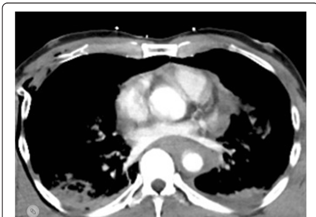
Fig. 1 CT Thorax after contrast dye injection showing the rupture of ascending aorta. Arrow highlights aortic wall

The therapy involved interdisciplinary surgical treatment involving cardiac, vascular, and trauma surgical teams. At first, a Thoracic Stent Graft (W. L. Gore & Associates, USA, TAG 28/15) was introduced into the descending aorta via the femoral artery in Seldingers Technique to cover the rupture of the descending aorta performed by vascular surgeons. The intraoperatively performed transesophageal echocardiography (TOE) confirmed the incomplete rupture of the ascending aorta (Fig. 2). Thereafter a median sternotomy was performed and extracorporeal circulation was installed after aortic cannulation of the proximal aortic arch and standard two-stage venous cannulation. After cross-clamping of the ascending aorta distally to the rupture site crystalloid cardioplegia was administered followed by blood cardioplegia. Intraoperative assessment of the aortic injury confirmed traumatic aortic rupture at the mid region of the ascending aorta. The aortic wall was incompletely ruptured with the rupture being covered by the pulmonary artery (Type II according to Goarin [10]). As a lucky consequence there was no blood effusion into the pericardium (Fig. 3). The ruptured aortic segment was replaced using a Gelweave 26 mm