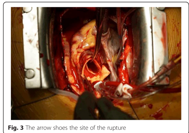
Fig. 3 The arrow shoes the site of the rupture

This case report describes the management of an incomplete aortic semi-circular traumatic rupture caused by failed suicide attempt due jumping from 12 m height, by replacement of the ascending aorta