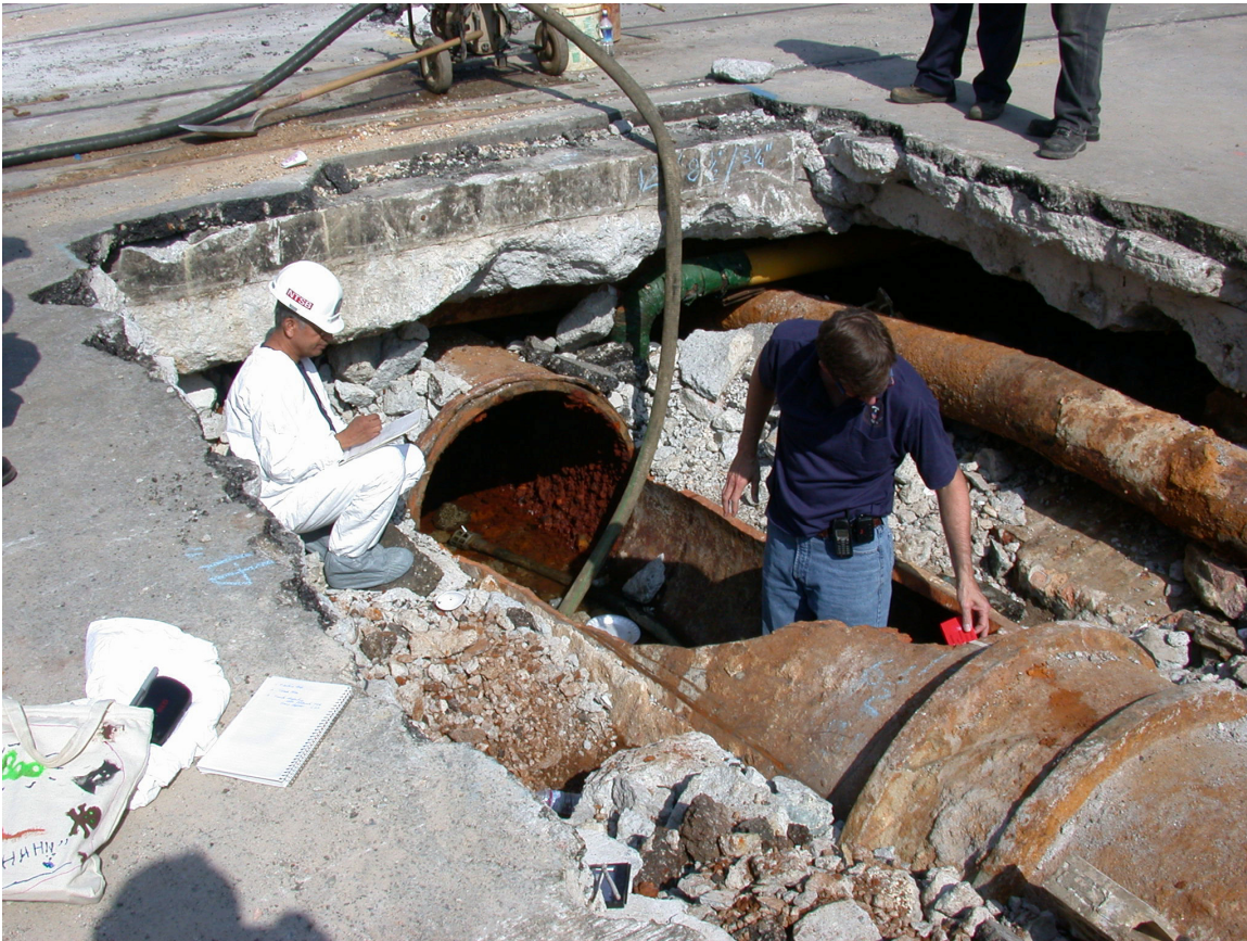
Figure 2. Broken 40-inch-diameter water main.

According to city records, notification was received of a water leak about 6:19 p.m., and the city sent a crew to investigate. The crew determined that a failure had occurred in the 40-inch-diameter cast iron water main that passes directly above the Howard Street Tunnel at station 63+15. 8 (See figure 2 showing broken water main.) The crew closed a 40-inch valve at the intersection of Lombard and Paca Streets. They also closed valves on an interconnected 20-inch-diameter water line. A 40-inch valve located 1 block to the east (as well as numerous interconnecting lines) was also closed to isolate the area of the break. The line was shut down by 11:59 p.m., about 5 hours 40 minutes after the appearance of water at street level. The city of Baltimore estimated that about 14 million gallons of water were lost from the water main between the time of the break and the time the line was shut down.