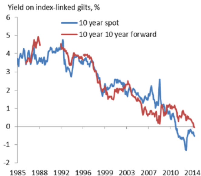
Chart 4 Real interest rates have also declined at longer horizons