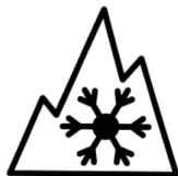
FIGURE 2: STANDARD WINTER TYRE IDENTIFICATION LOGO

Winter tyres can be distinguished from other tyres, including snow and mud tyres, as they are marked with a standard logo showing a snowflake and a mountain, which is shown in Figure 2.