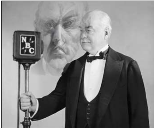
Figure 2: Nicholas Murray Butler , Pilgrims Society president (1928-1946); Columbia University president (1902-1945); C.I. Scofield handler. Background: Ahriman.

Indeed, the stated goal of the Pilgrims Society was/is to Annex America back into the British Empire . It’s a 200-year plan starting in 1902.