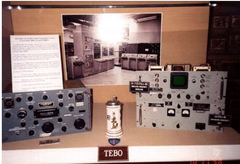
Anything here look familiar?

The museum is located very near the National Security Agency Ft. Meade Maryland. It is roughly an hours drive from Washington DC (off peak). Free Admission Open to the Public: Monday-Friday 9:00-4:00 1st and 3rd Saturdays 10:00-2:00 Closed Sundays and Federal Holidays