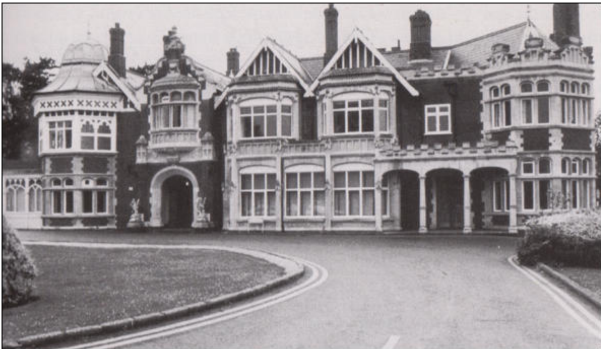
Bletchley Park in 1939

Francis Harry Hinsley was originally sent to Hut 3: "Hut 3 was set up like a miniature factory. At its centre was the Watch Room - in the middle a circular or horseshoe-shaped table, to one side a rectangular table. On the outer rim of the circular table sat the Watch, some half-dozen people. The man in charge, the head of the Watch or Number 1, sat in an obvious directing position at the top of the table. The watchkeepers were a mixture of civilians and serving officers, Army and RAF. At the rectangular table sat serving officers, Army and RAF, one or two of each. These were the Advisers. Behind the head of the Watch was a door communicating with a small room where the Duty Officer sat. Elsewhere in the Hut were one large room housing the Index and a number of small rooms for the various supporting parties, the back rooms. The processes to which the decrypts were submitted were, consecutively, emendation, translation, evaluation, commenting, and signal drafting. The first two were the responsibility of the Watch, the remainder of the appropriate Adviser." (8)