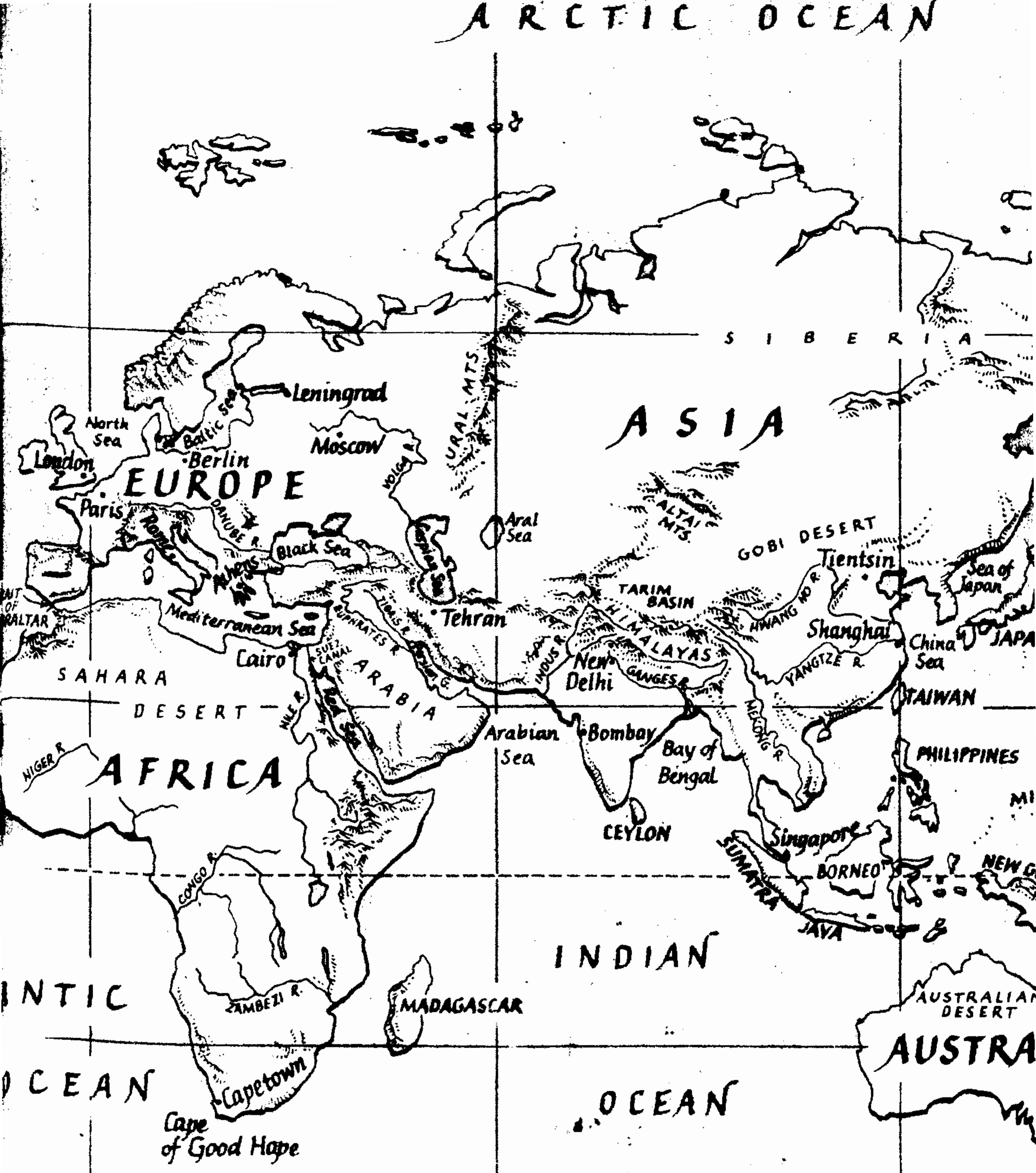
THE WORLD MILLER CYLINDRICAL PROJECTION Scale at the Equator 1:115,000,000