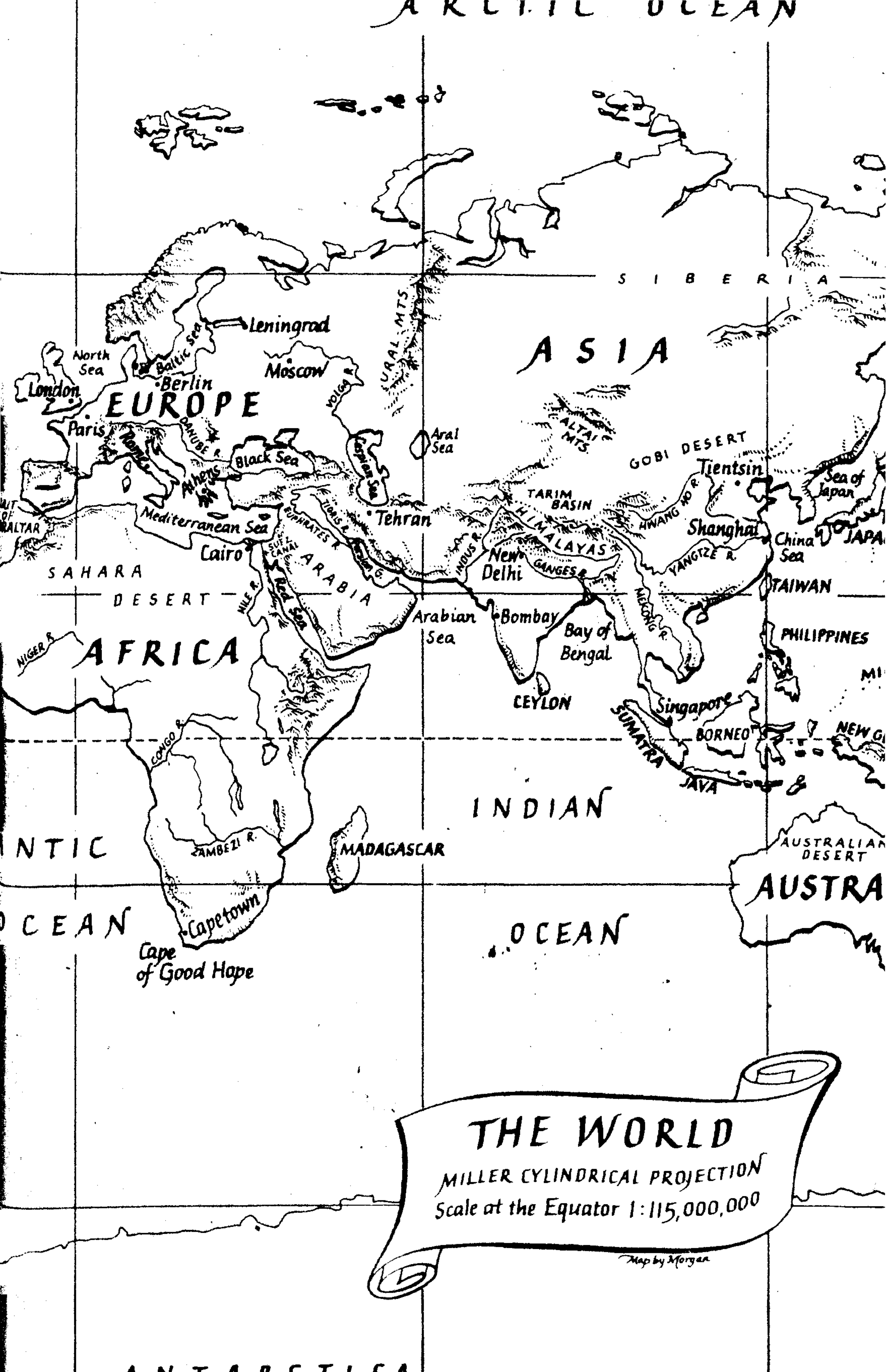
THE WORLD MILLER CYLINDRICAL PROJECTION Scale at the Equator 1:115,000,000 Map by Morgan