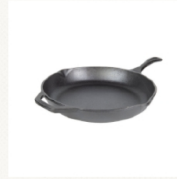
Chef Collection Skillets $24.95 to $49.95