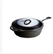
Cast Iron Covered Deep Skillet $54.95 to $69.95