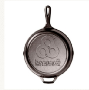
Bonnaroo Skillet $24.95