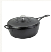
Blacklock Deep Skillet With Lid $150.00