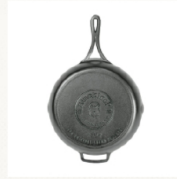
Blacklock Skillet $37.50 to $100.00