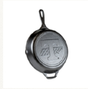
University of Tennessee Skillet $24.95