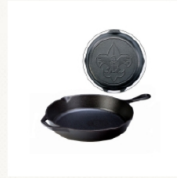
Cast Iron Boy Scout Skillet $39.95