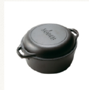
Double Dutch Oven $59.95