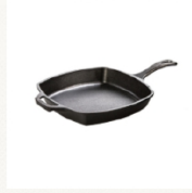
Square Cast Iron Classic Skillet $11.95 to $24.95