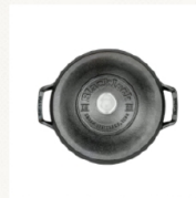
Blacklock Dutch Oven $150.00