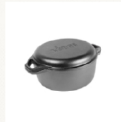
Chef Collection 6 Quart Double Dutch Oven $84.95