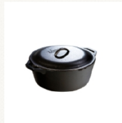
Cast Iron Dutch Ovens $34.95 to $79.95