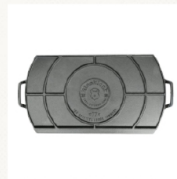
Blacklock Double Burner Griddle $100.00