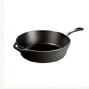
Cast Iron Deep Skillet $34.95 to $49.95