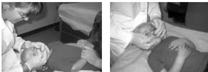
Figure 1. Position of the child for conducting clinical evaluation