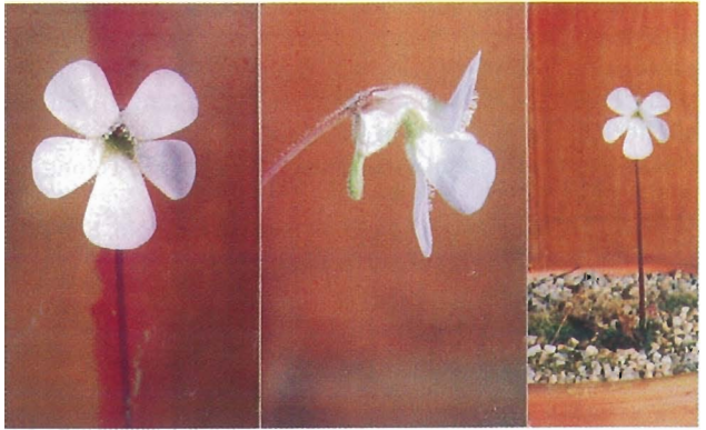
Figure 1. Pinguicula acuminata . Note white flower, acute spur angle, and that the flower appears to arise directly from the soil due to the buried winter leaves.

although not closely related - are remarkably similar to one another when not in flower. In some circles these are considered to be difficult plants to cultivate - if not nearly impossible. This reputation (which I consider to be unfounded) may be offputting to some growers which is a shame as both of these species are very attractive and interesting plants. Although it is true that the cultivation of these plants requires some care (particularly during the winter months), the attention that the plants