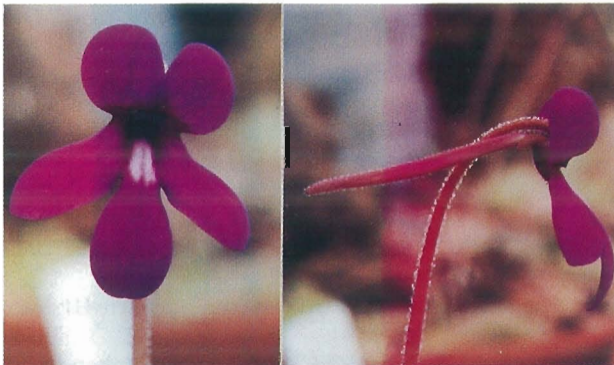
Figure 2. Pinguicula macrophylla .

require is offset by the rewards of the beautiful flowers and striking foliage of these two species. The purpose of this article is to describe these two stunning Pinguiculas and to comment on my experiences of cultivating these species over the past few years. Hopefully, this article will provide encouragement for other growers to try these plants.