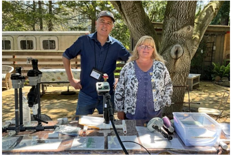
Our vision is to cultivate environmental stewardship one garden at a time.