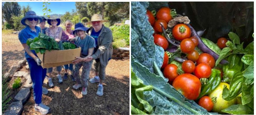
Top row: Fall 2023 Jamboree event. Bottom row: Herbs and vegetables harvested from The Children's Garden are provided to the nonprofit Valley of the Moon Children's Center.

300 Jamboree Attendees Enjoyed Educational and Craft Activities.