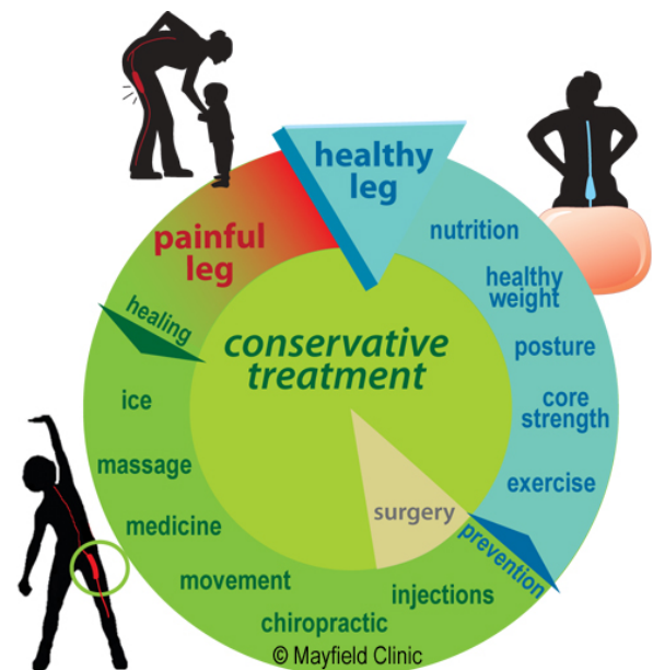
Figure 2. Exercise, strengthening, stretching and ideal weight loss are key elements to your treatment. Make these a part of your life-long daily routine.

Surgery: Surgery is rarely needed unless you have muscle weakness, a proven disc herniation, cauda equina syndrome, or severe pain that has not