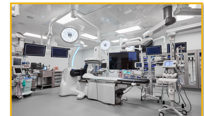
Monroe Medical Center, Hybrid Operating Room