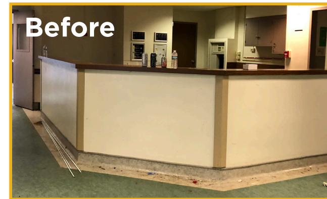
Before: Women's Services nurses station

In revitalizing the campus, which had been shuttered since 2013, Ochsner LSU Health made meaningful and necessary updates by upgrading elevators, repaving parking lots, providing new LED interior lighting, and rebuilding central plant infrastructure. The dramatic south wing drive water fountains were also repaired for staff and visitors to enjoy.