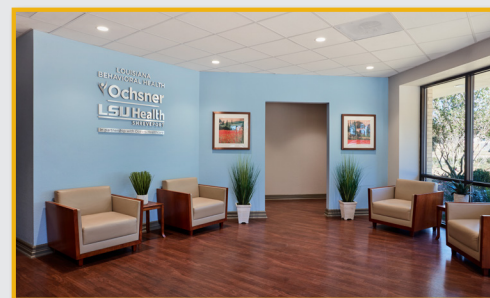
Louisiana Behavioral Health

In just three years, Ochsner LSU Health has expanded from two to four inpatient hospitals, including Louisiana Behavioral Health, increasing access to care and providing a better treatment environment for behavioral health patients.