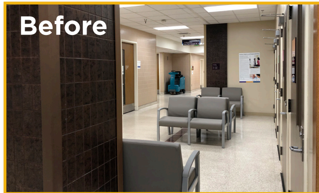
Before: Day Surgery

Over the past three years, numerous infrastructure systems including HVAC, chiller/cooling towers, lighting, medical gases, roofsw and elevators have been upgraded at the Ochsner LSU Health Shreveport – Academic Medical Center, which have extended the life and overall reliability of the campus to provide continuous care to its community.