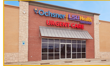
Urgent Care, West Monroe

More than one million square feet have been added since 2018, making healthcare more accessible.