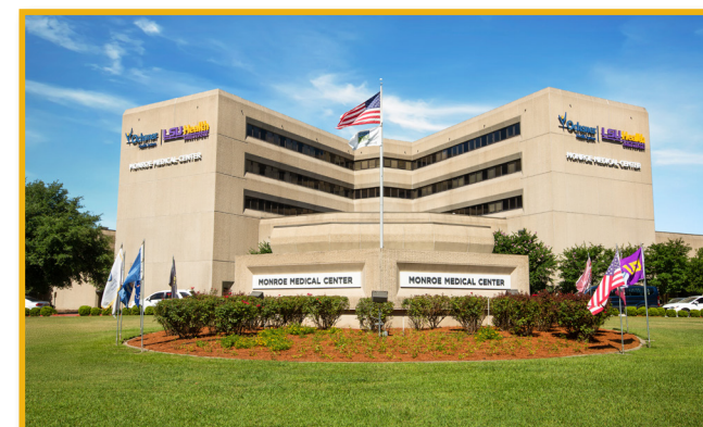
Ochsner LSU Health — Monroe Medical Center

Ochsner LSU Health invested in many infrastructure projects to improve redundancy and overall reliability for the Monroe Medical Center including upgrades to the existing high-voltage distribution, chilled water, pneumatic tube, building automation and HVAC systems.