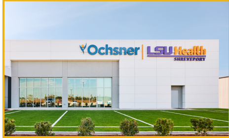
Viking Drive Multispecialty Center, Bossier City

While significantly improving the overall environment of care within its Ambulatory Care Center and other existing outpatient clinics through modernizing finishes and furnishings; Ochsner LSU Health also developed over 11 newly renovated outpatient clinics and a multispecialty medical office building to increase access to care for new and existing patients.