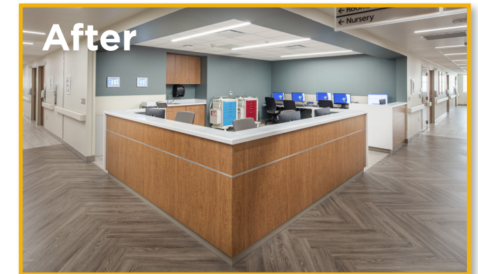
After: Women's Services nurses station