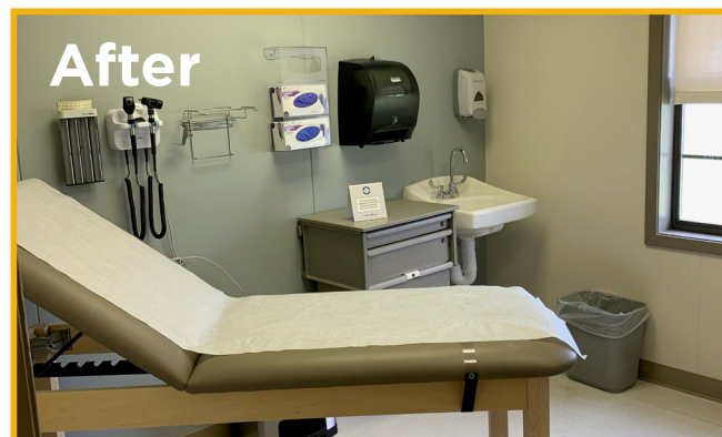
After: Community Health Center, St. Vincent exam room