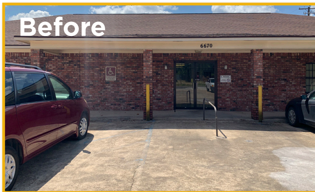
Before: Community Health Center, St. Vincent exterior

Committed to making healthcare available when and where patients need it, Ochsner LSU Health has increased outpatient and community locations from seven in 2018 to 19 locations and a multispecialty medical office building with multiple clinics.