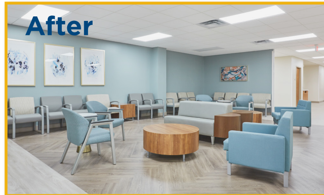
After: Day Surgery

In just three years, Ochsner LSU Health has expanded from two to four inpatient hospitals, including Louisiana Behavioral Health, increasing access to care and providing a better treatment environment for behavioral health patients.