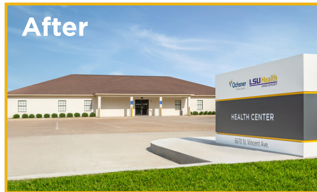
After: Community Health Center, St. Vincent exterior