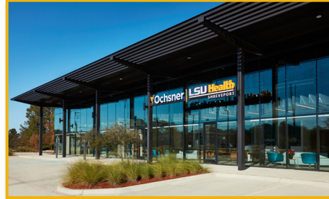
Spring Lake Primary Care Clinic, Shreveport