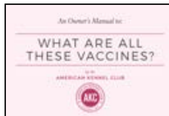
WHAT ARE ALL THESE VACCINES?