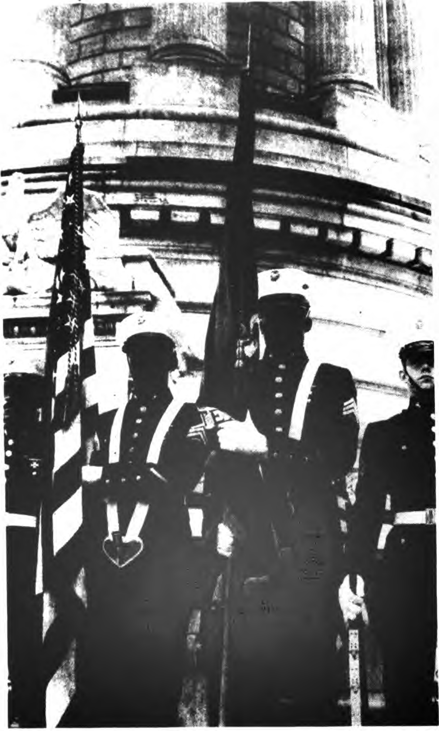
Not even the "uncensored" Richard Pryor could shake these young cadets of military discipline from their post. Motionless in a battle of silence they carried out their duties with a militant honesty at last week's Memorial Day service held at Grants Tomb in Manhattan.