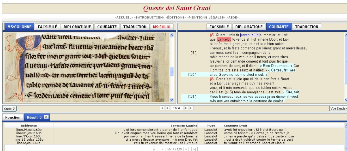
Figure 2 : sample interface of the web application prototype of the TXM platform rendered by Firefox. The upper panel displays two different views of the edition of the manuscript « la Queste del Saint Graal » (Marchello-Nizia, to be published) : on the left side the image of one column of the manuscript, on the right side one of the three available critical editions encoded in XML-TEI P5 and rendered in HTML. The lower panel displays a kwic concordance of the “Lancelot” word. A double-click on a line of the concordance displayed in the upper panel the column numbered 160d (right column of verso of folio 160) of the edition in which the keyword appears highlighted in red. The concordance was built by the same toolbox which generated the one illustrated on figure 1.