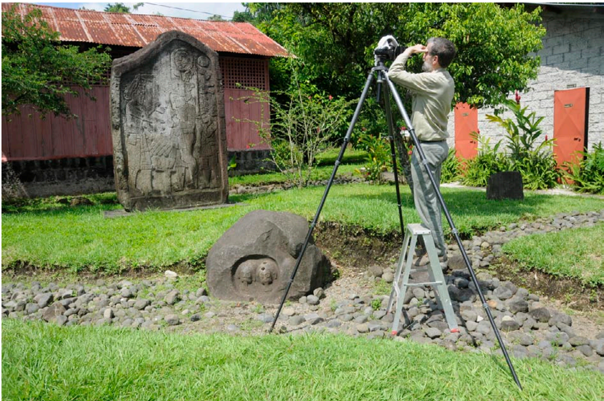
Figure 16. The same Gitzo tripod can shoot low, or high.