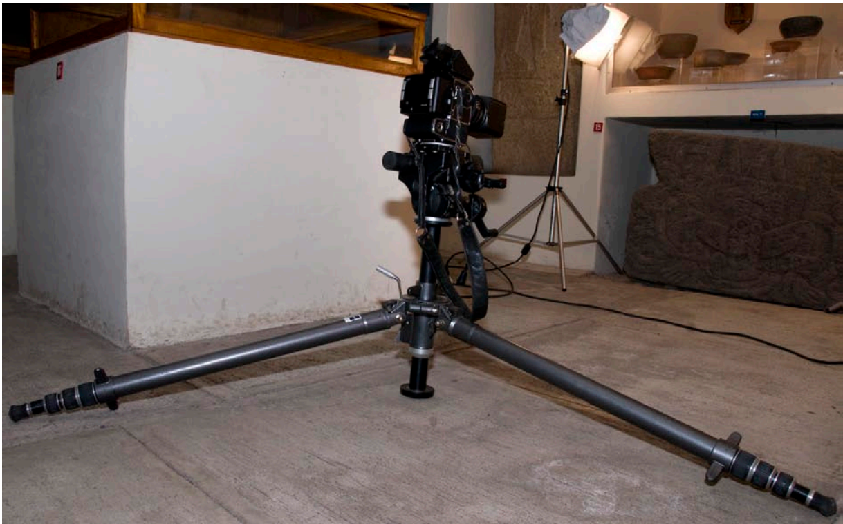
Figure 7. Here you can see how heavy is the equipment we use to take professional photos. In the top of the tripod you can see the Hasselblad camera with PhaseOne P25+ digital back and the Manfrotto tripod head, that's why we prefer too uses Gitzo tripods.