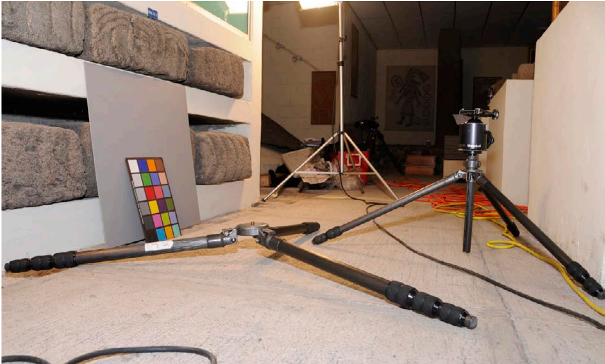
Figure 11. Here you can see the difference between a tripod with center post (in the back right) and a tripod with no center post (front left). Both are Gitzo brand (Gitzo makes about every size, shape and structure that you might need). Note that with the center post, the camera is far too high to photograph the sculpture at the bottom.