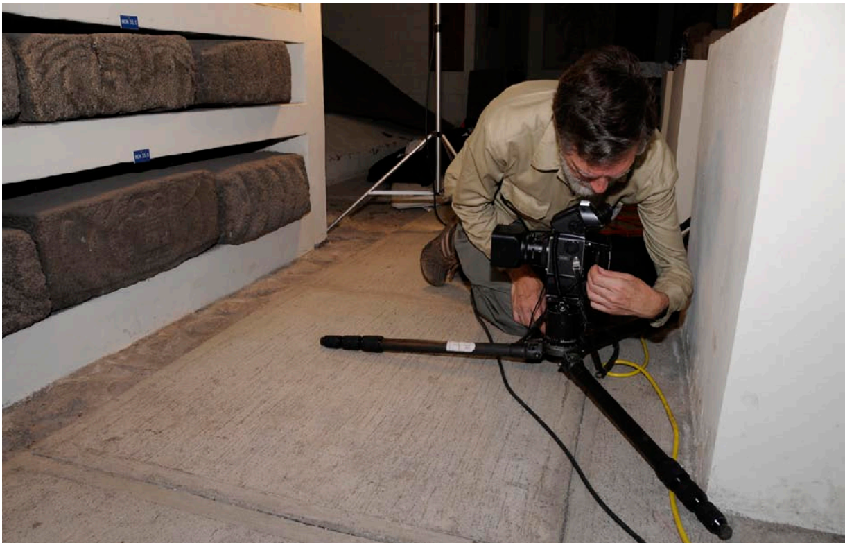
Figure 14. Here I really need a different viewer for this low angle photography.