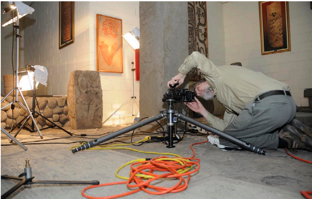
Figure 5. The Gitzo tripod is a good option to use when you have a medium or large format camera.