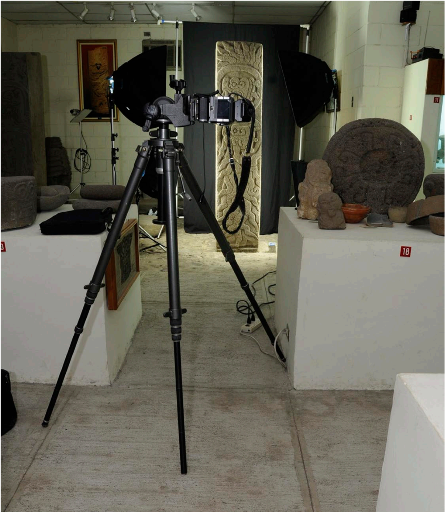
Figure 1. Here you can see the Gitzo G1504 MK2 tripod, Hasselblad ELX camera with PhaseOne P25+ digital back and Westcott spiderlite, in museum Santa Lucia Cotzumalguapa, Escuintla, Guatemala.