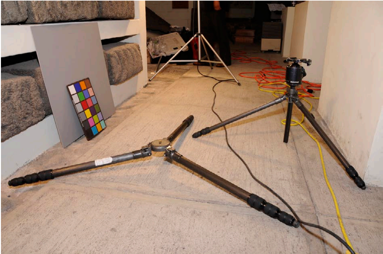
Figure 9. If you have a center post, it is easy to raise your camera without raising all three legs. BUT, but a center post introduces wobble. I prefer a studio tripod with absolutely no center post (for better stability).