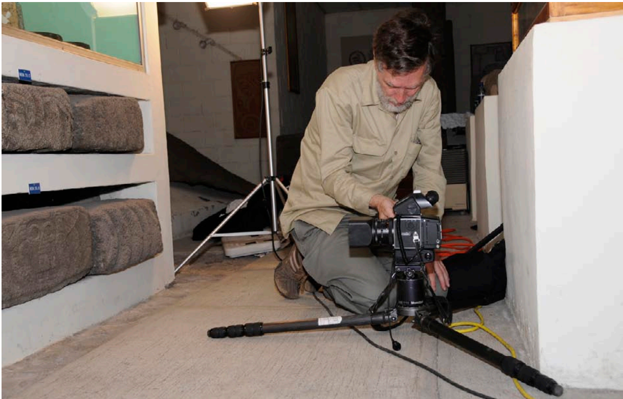
Figure 12. Now we have moved the tripod head and camera to the Gitzo model with no center post. Now I can take the photograph without putting the camera at an awkward and inappropriate angle.