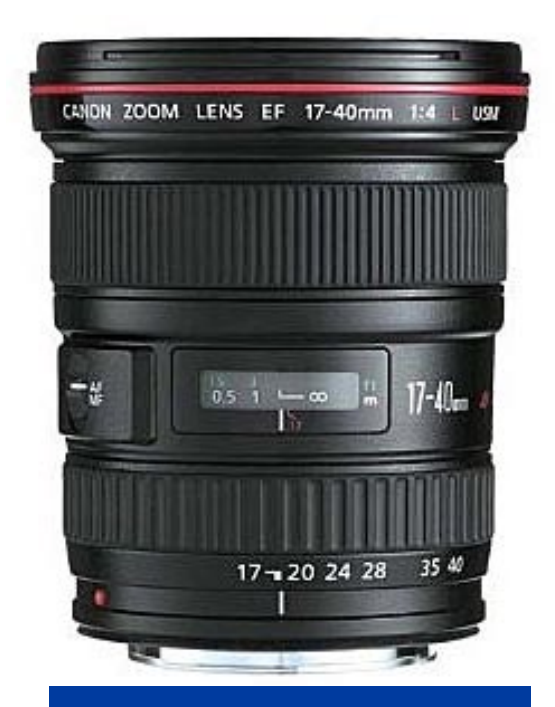
Canon EF 17-40mm f/4L USM