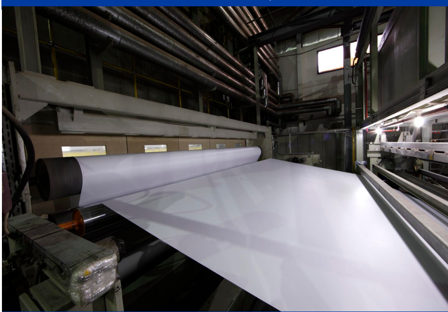
This view is hard to do considering that in a factory there is no space to get away and take the whole object.

Picture taken with a Canon EF 14mm f/2.8L II USM