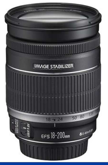
Canon EF-S 18-200mm f/3.5-5.6 IS Standard Zoom Lens.