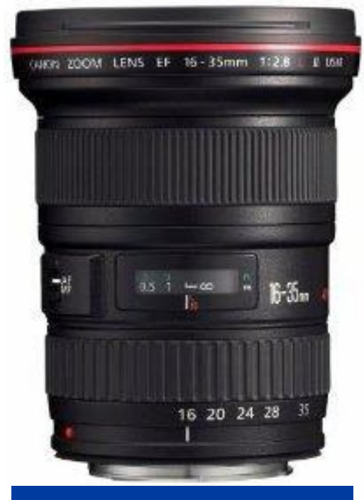
Canon EF 16-35mm f/2.8 L II USM

Since none of the ultra-wide zoom lenses have a good set of reviews, I would prefer to remain with a prime lens, and would like to evaluate the Canon EF 24mm f/1.4L II USM for all the many situations when 14mm is too wide but a 28mm and especially a 35mm would not be wide enough.