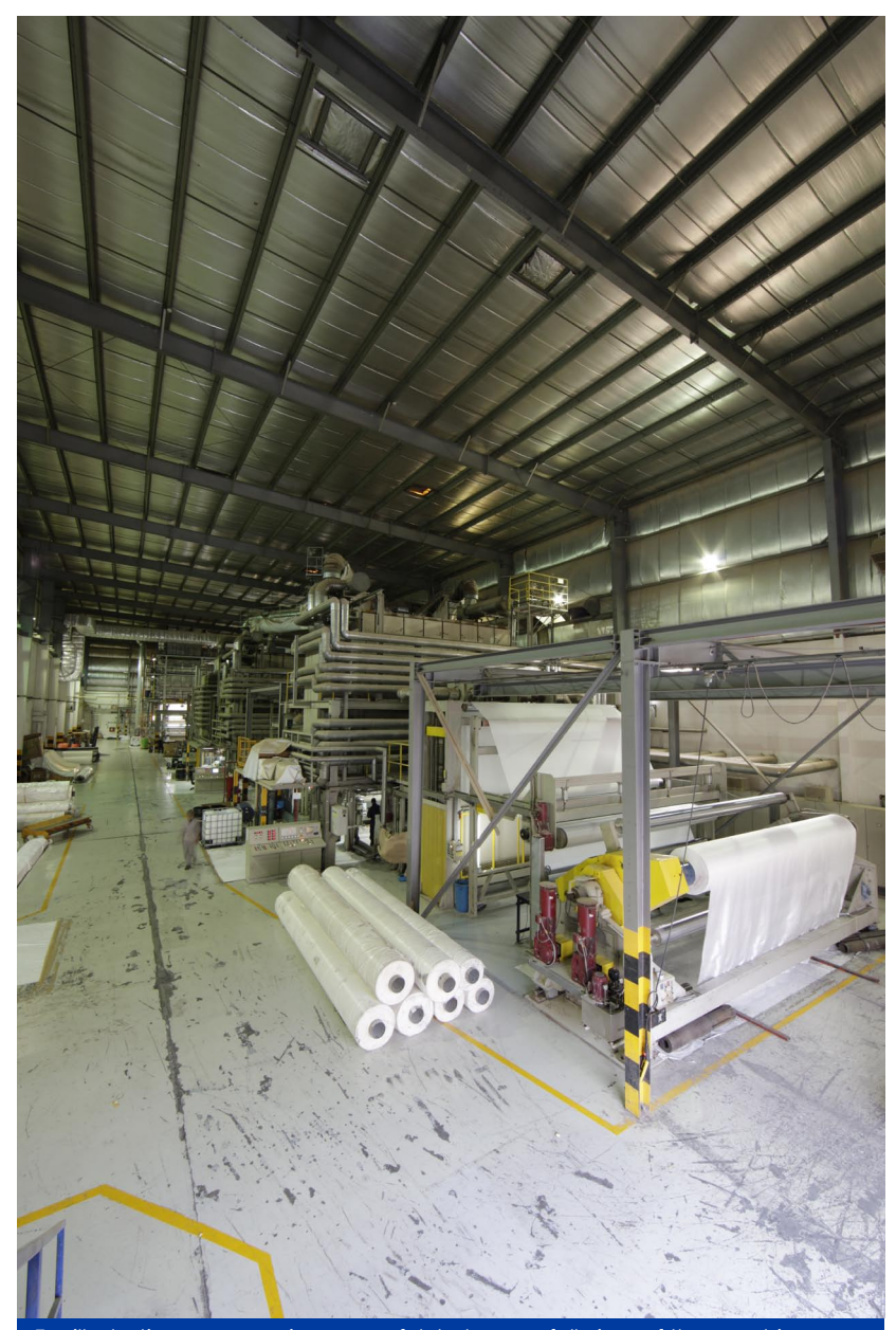
For illustrative purposes is very useful, to have a full view of the machine you are talking about