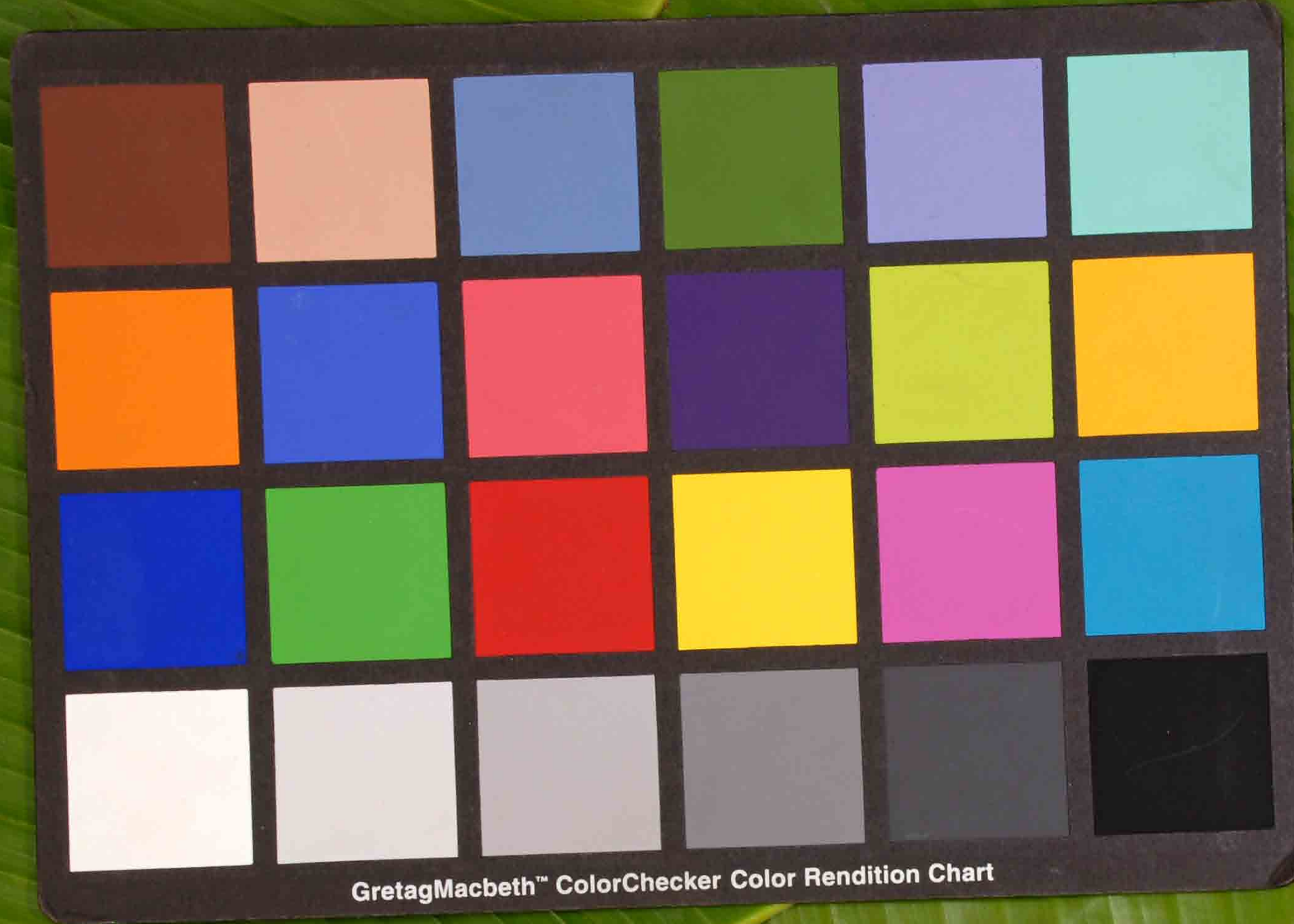
GretagMacbeth™ ColorChecker Color Rendition Chart