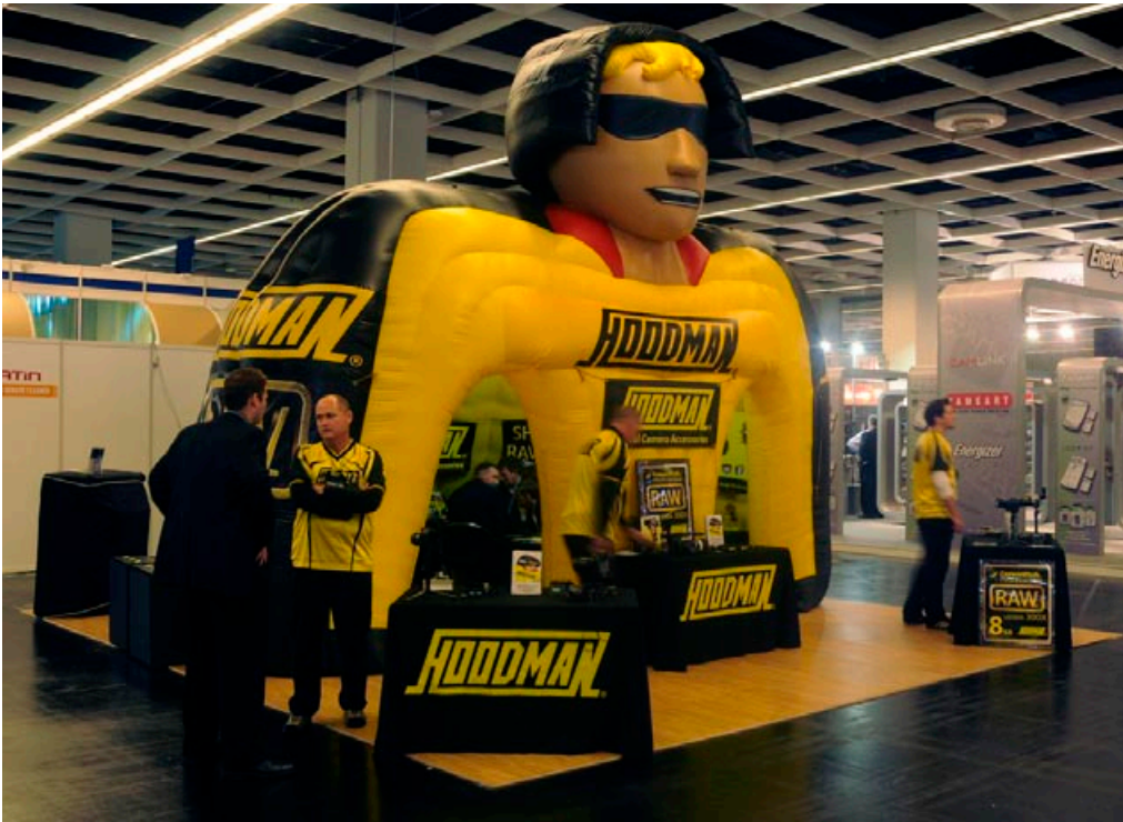
Hoodman booth at Photokina 2008 tradeshow.