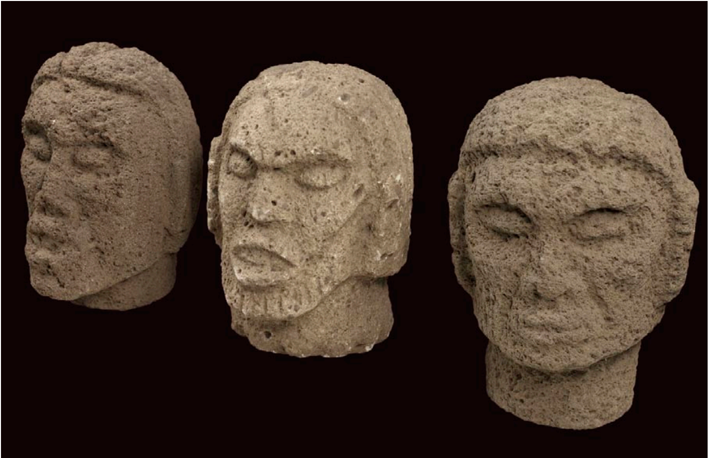
Here are the photographs of 7th-9th century Cotzumalhuapa sculpture, Escuintla area, Guatemala.