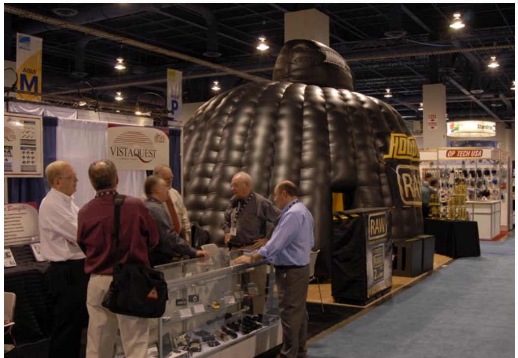
Hoodman booth at PMA 2007 tradeshow.