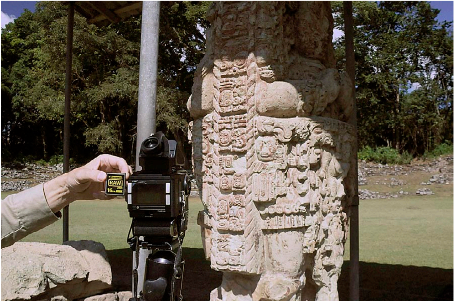
16 GB Hoodman CF card is helpful for archaeological photography with medium format P25+ digital back, at Copan archaeological site, Honduras.