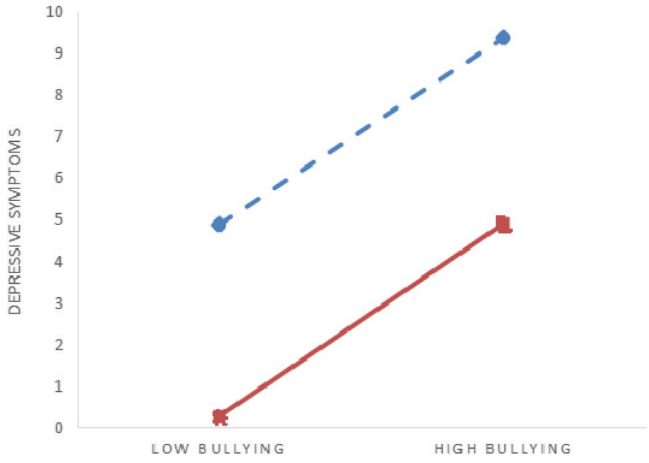
Fig. 2 Moderating effects of mental health literacy between life course bullying experience and depressive symptoms.——high menta health literacy——low mental health literacy

bullying on depression and anxiety (see Figs. 2 and 3). Simple slope test showed that for both low and high mental health literacy, college students showed a significant upward trend in depressive symptoms as bullying increased (simple slope = 4.100, t = 3.591, P < 0.001; simple slope = 4.230, t = 2.758, P < 0.01).