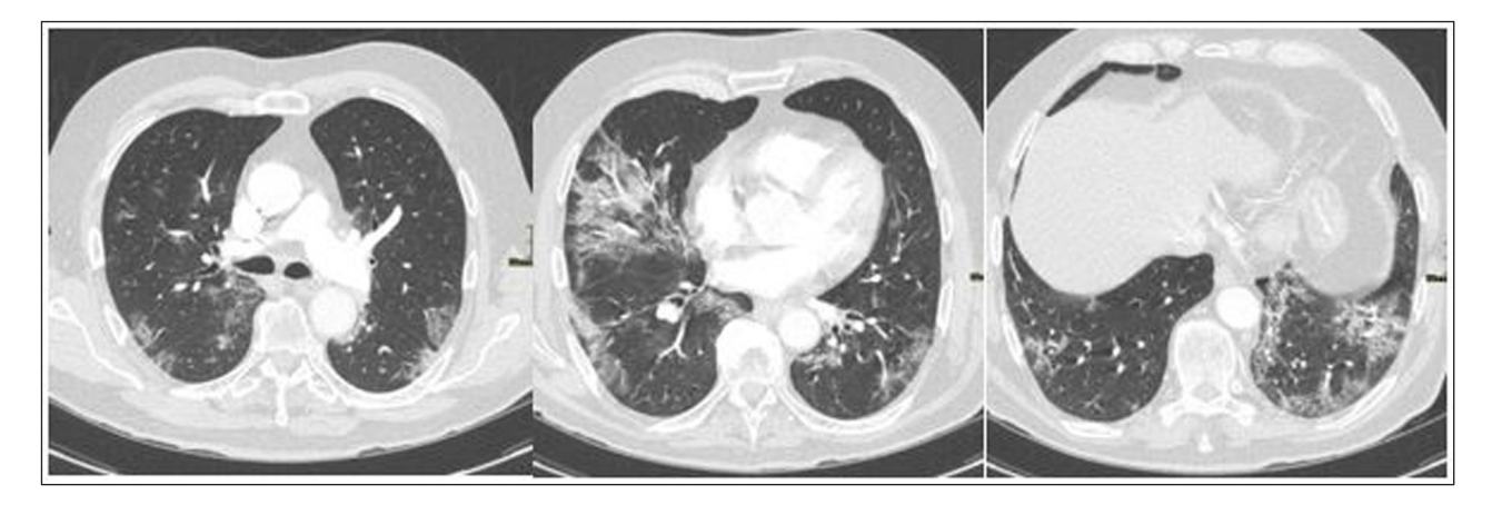
Figure 2 Positive CO-RADS chest CT for COVID-19 with a negative RT-PCR test: This 42-year-old patient was tested negative for COVID-19 with RT-PCR and showed multiple symptoms for COVID-19 (cough, fever, and anosmia). The chest CT showed multiple ground glass opacities and consolidation areas with crazy-paving patterns and was scored as CO-RADS 4. This patient was also considered as positive for COVID-19 by the clinician.