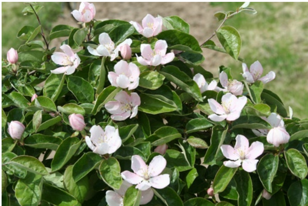
The attractive flowers and foliage of quince.

like 'Orange' (syn. = 'Apple') were as often as not grown from seed rather than propagated as clones. Quince is easily grown from either hardwood or softwood cuttings, and is readily grafted onto another quince rootstock. Although it is an important dwarfing rootstock for pear, quince should not be grafted onto pear roots because this reverse graft is not reliable.