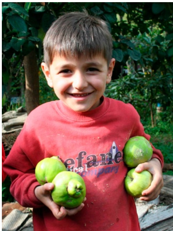
A young boy in Georgia's northeast province of Kakheti displays quince fruit from a tree in the village of Shilda. Scions of the Shilda quince were collected by ARS genebank curators Joseph Postman and Ed Stover during a 2006 expedition to the Caucasus region. A tree is growing in quarantine at Beltsville, Maryland, and will be sent to the USDA-ARS genebank in Oregon upon release

soil conditions both as a rootstock for pear or for production of quince fruit. Very slight progress in soil adaptation was achieved by selecting somoclonal variants of rootstock clone Quince A following multiple generations of in vitro culture on high pH media (Bunnag et al. 1996). Quince for fruit production will benefit from earlier ripening, and elimination of summer "rat-tail" blooms, which predispose a tree to attack by fire blight. Fruits that are picked too green will never ripen properly (McCabe 1996). Resistance to the fungal rusts and mildews will allow quince to be produced with fewer pesticide applications.