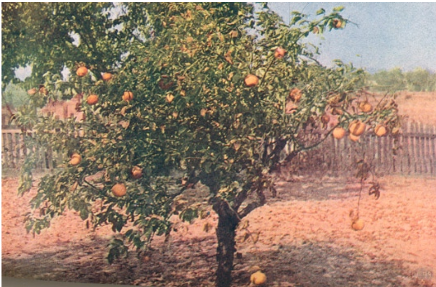
Burbank's ‘Pineapple’ quince as seen in a photograph from the 1914 multi-volume publication Luther Burbank, His Methods and Discoveries and Their Practical Application .