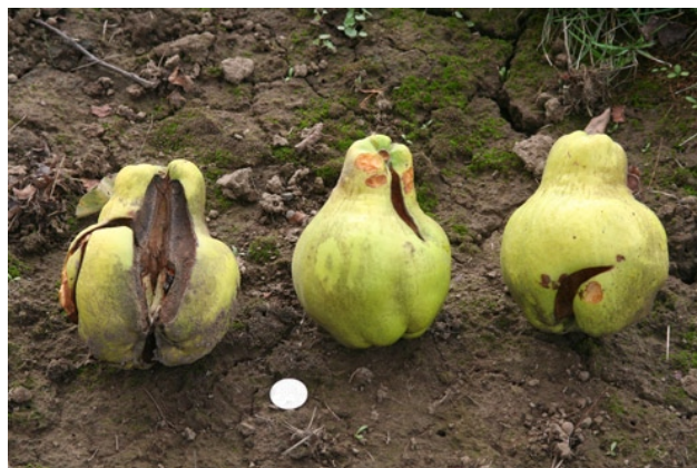
The Turkish cultivar 'Harron' has the largest fruit size of the hundred or so quince clones growing at the USDA genebank, but the fruit may crack badly when exposed to rain just before it is ripe.

Genetic improvements needed for expanding the use of quince as a dwarfing pear rootstock include increased resistance to fire blight for warm and humid summer climates, and increased winter cold-hardiness for northern climates. Adaptation to alkaline soils will allow quince production to expand to more diverse