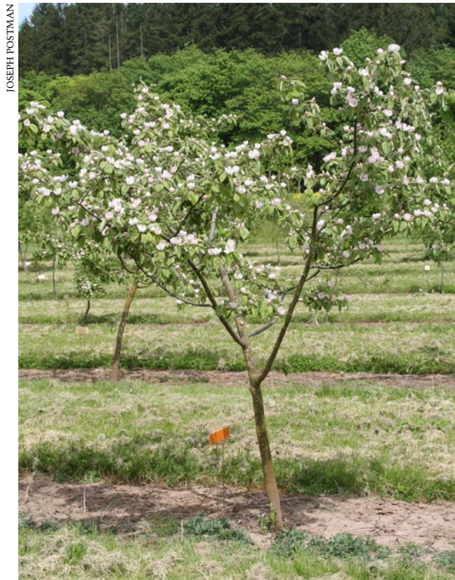
This young quince tree, growing in the genebank orchard at USDA-ARS, Corvallis, Oregon, has been pruned to open up the crown and remove basal suckers.

turist Donald Wyman (Wyman 1965) did not consider Cydonia worthy of his list of recommended landscape trees. He relegated it to his secondary list because of inferior flower interest, poor growth habit, and pest problems. However, Cydonia is an essential component of many historic gardens, and Frederic Olmstead included the common quince as a valuable plant in some of his landscapes (Deitz 1995).