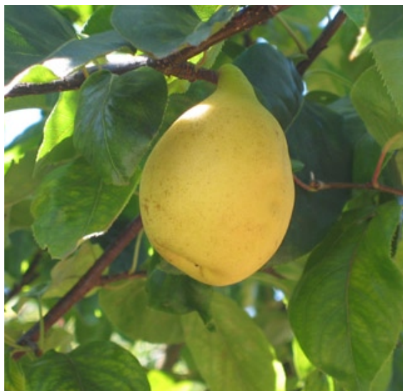
A Pyronia fruit—from a cross of Pyrus pyrifolia (Japanese pear) and Cydonia oblonga —growing in the USDA genebank orchard.

and leaf size of cultivated varieties can be many times larger than the wild type described above. All varieties are self-pollinating.