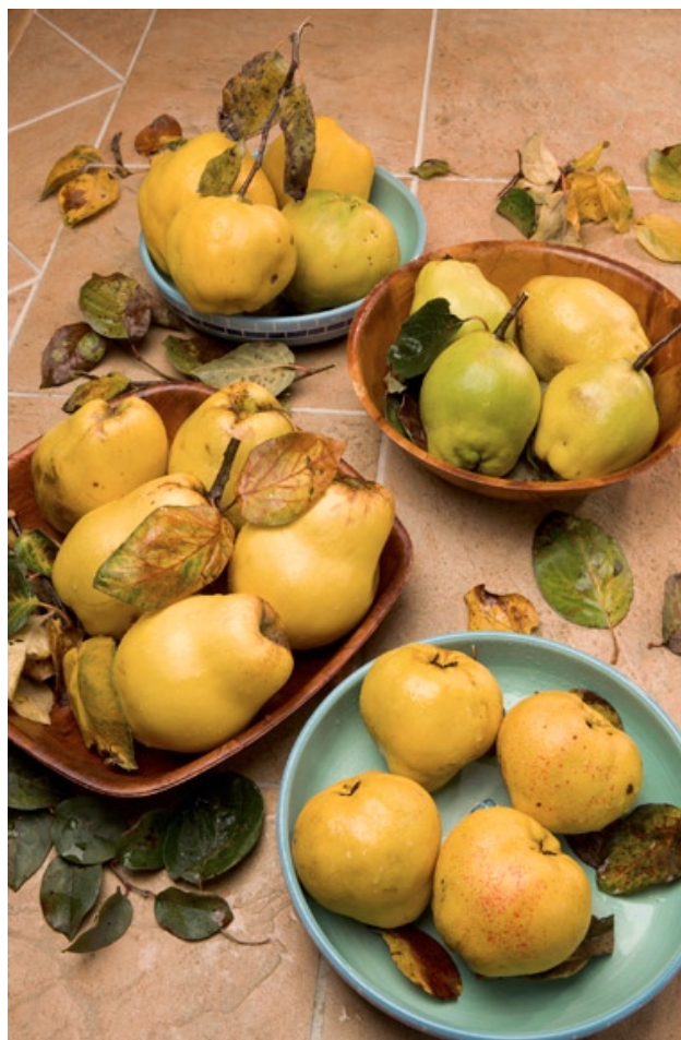
These bowls of quince show the diversity of shapes found in quince fruit.

Few small trees rival the quince in becoming interestingly gnarled and twisted with age. Nonetheless, renowned Arnold Arboretum horticult-