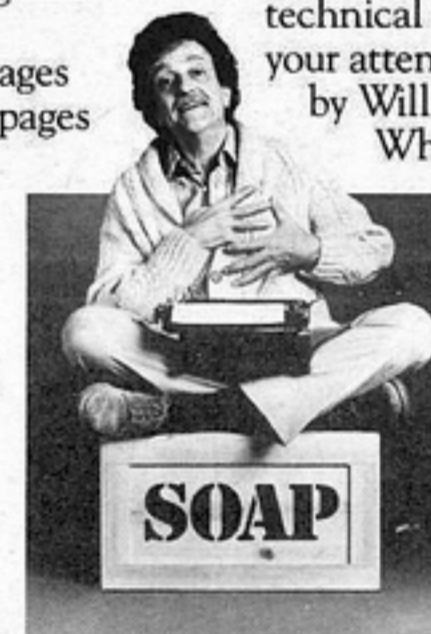
"Pick a subject you care so deeply about that you'd speak on a soapbox about it."

For a discussion of literary style in a narrower sense, in a more technical sense, I commend to your attention The Elements of Style , by William Strunk, Jr., and E. B. White (Macmillan, 1979).