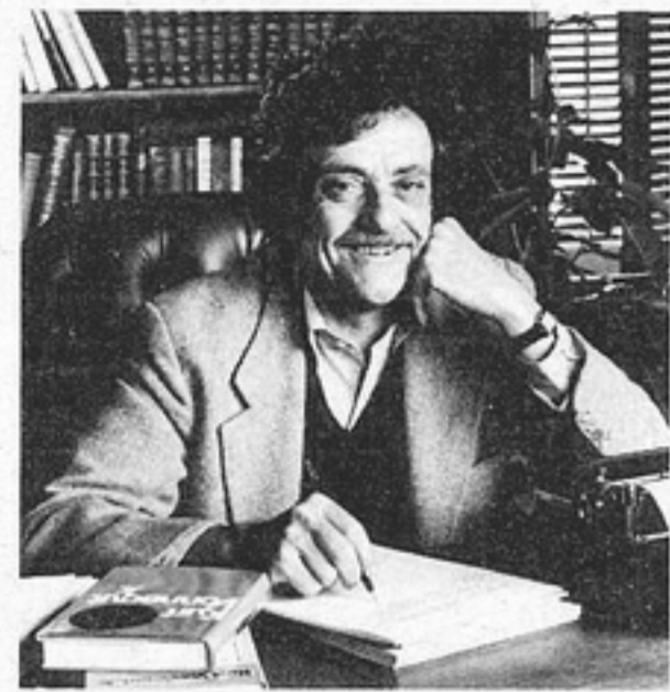
International Paper asked Kurt Vonnegut, author of such novels as "Slaughterhouse-Five," "Jailbird" and "Cat's Cradle," to tell you how to put your style and personality into everything you write.

Newspaper reporters and technical writers are trained to reveal almost nothing about themselves in their writings. This makes them freaks in the world of writers, since almost all of the other ink-stained wretches in that world reveal a lot about themselves to readers. We call these revelations, accidental and intentional, elements of style.