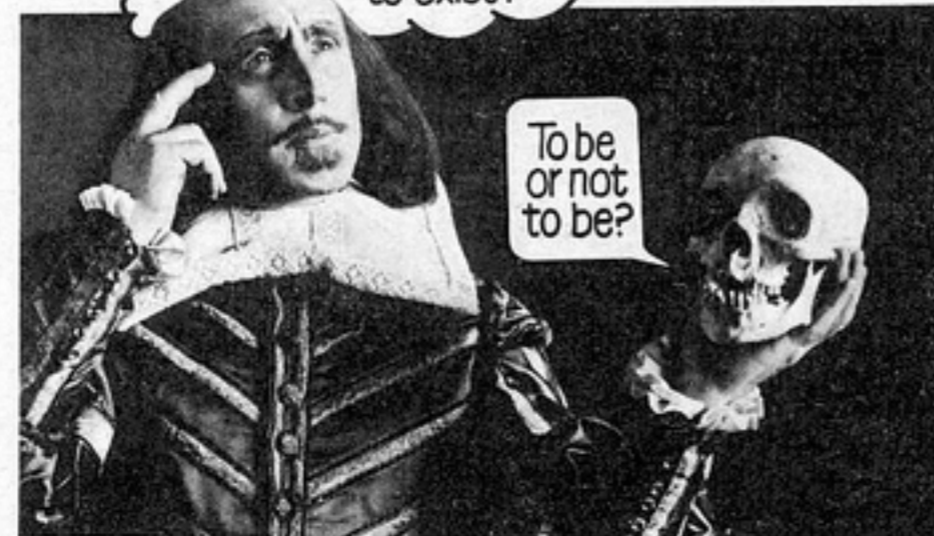
"Keep it simple. Shakespeare did, with Hamlet's famous soliloquy."

Should I act upon the urgings that I feel, or remain passive and thus cease to exist?