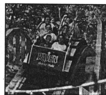
The Raven: Voted one of the Best Wooden Coasters

Thank you to the staff and to all the readers of Amusement Today for this honor. As the first-ever recipient of the Golden Ticket Award for Friendliest Staff, we'd like to thank all of our staff members for a job well done.