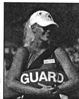
Voted Friendliest Staff