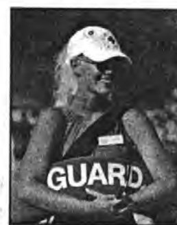
Voted Friendliest Staff