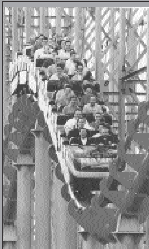
Mamba Worlds of Fun Kansas City, Mo.