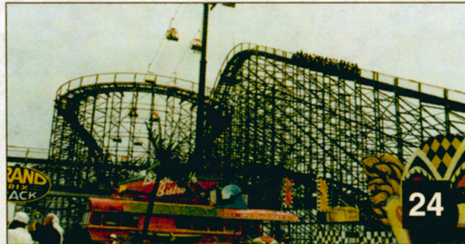
Top clockwise: (2) Holiday World's Raven; (3) Visionland's Rampage; (4) Michigan Adventure's Shivering Timbers; (10) Oakwood's Megaphobia; (13) Knott's GhostRider and (24) Morey's Great White