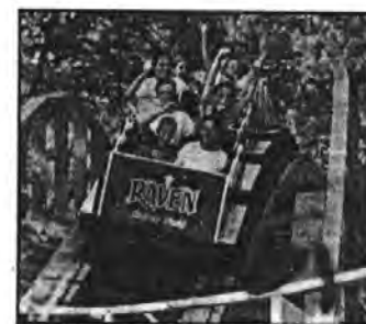
The Raven: Voted one of the Best Wooden Coasters

Thank you to the staff and to all the readers of Amusement Today for this honor. As the first-ever recipient of the Golden Ticket Award for Friendliest Staff, we'd like to thank all of our staff members for a job well done.