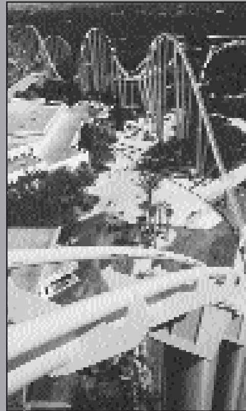
Steel Eel SeaWorld San Antonio San Antonio, Texas

Morgan is the proud builder of these fine STEEL coasters. Thanks for the Top 25 votes.