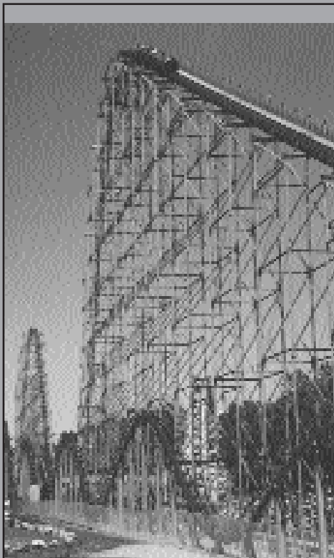
Steel Force Dorney Park Allentown, Pa.