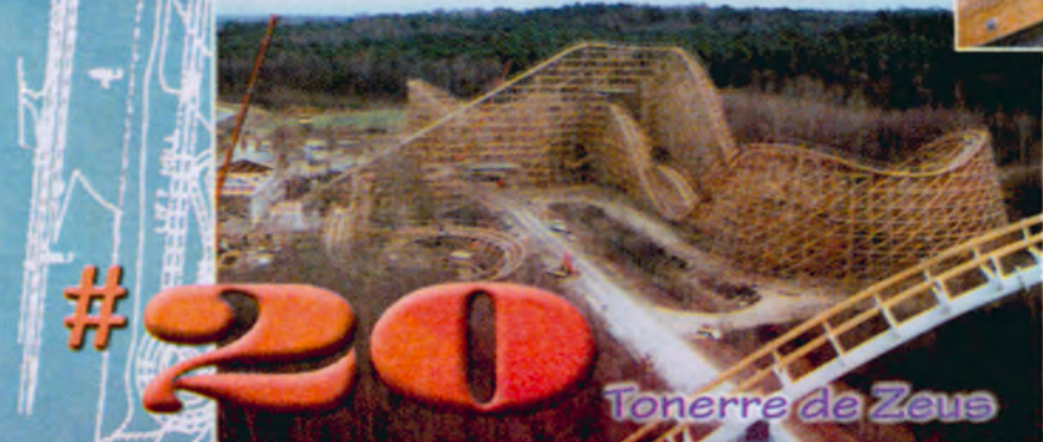
Tonerre de Zeus

Custom Coasters, Inc. International Hollywood, Florida