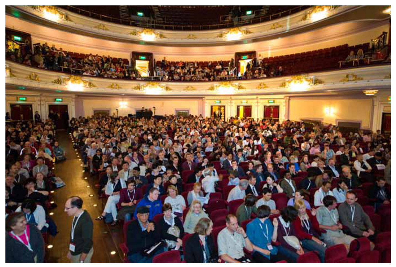
Mycologists attending the general meeting and awards ceremony of the IMC9 in the Usher Hall, Edinburgh.

For the special case of the IMA Young Mycologist Awards for IMC9, each IMA Young Mycologist Award Regional Committee must be organized and announced to the IMA Executive Committee by May 1, 2011. The membership of each Regional Mycological Member Organization must be notified of the nomination procedure by June 1, 2011. Nominations must be received by each IMA Young Mycologist Award Regional Committee by September 1, 2011. The IMA Young Mycologist Award Regional Committees must communicate their nomination materials and their choice to the IMA Young Mycologist Awards Committee by October 1, 2011. The IMA Young Mycologist Awards Committee shall announce the awards by November 1, 2011. The awards will be presented at IMC10 in Thailand in 2014.