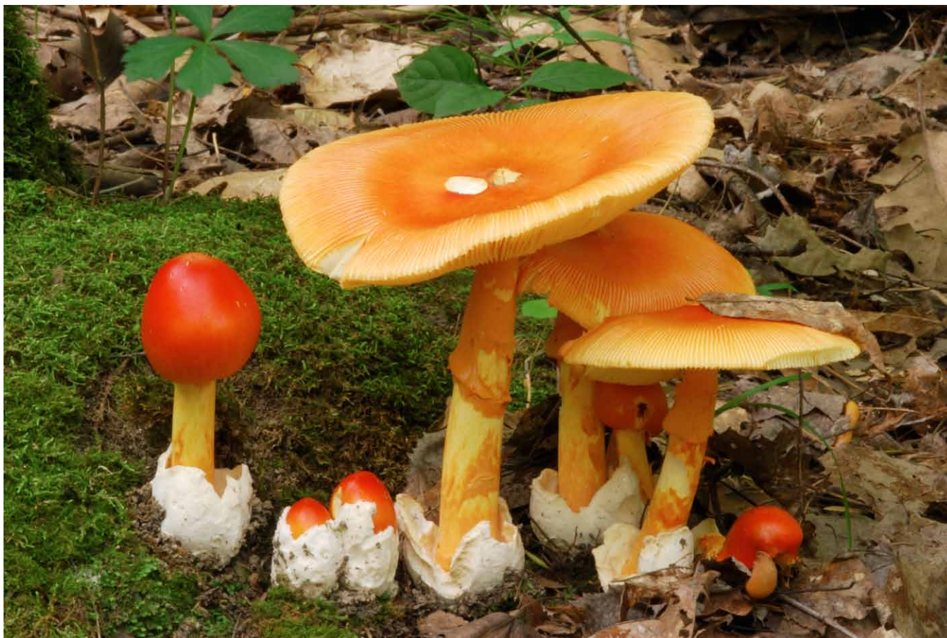
Fig. 1. Amanita jacksonii from a population in the province of Québec (Canada).

other Amanita genomes have been recently sequenced, A. brunnescens , A. polypyramis , and A. inopinata , with the aim of assessing the dynamics of transposable elements in EM and asymbiotic species within the genus (Hess et al. 2014). Amanita muscaria has also been used as a model for understanding the biosynthetic pathways of betalain pigments, which are commercially used to dye food and shown to have antioxidant properties (Hinz et al. 1997, Strack et al. 2003).