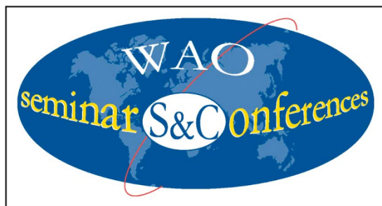
FIGURE 4. Logo of the Seminars and Conferences program of the World Allergy Organization.

Not only was the concept of GLORIA unique, so was the idea of sponsorship. Pharmaceutical companies were asked to contribute a relatively small amount ($45,000 per company), and multiple companies were enlisted to sponsor the program. We gave equal credit to each sponsor, and then opened up GLORIA to WAO Member Societies. The initial lectures were allergic rhinitis and allergic conjunctivitis. Over the next 10 years, lectures were prepared and posted for downloading on the WAO Web site ( www.worldallergy.org ), covering these additional topics: Allergic emergencies, immunotherapy,