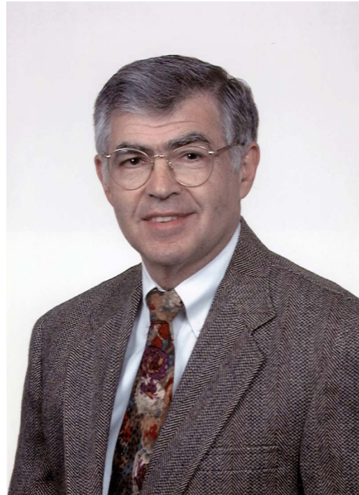
FIGURE 7. Allen Kaplan, WAO President (2000–2003).

generated at the retreat held in 1998. Thus, officially, IAACI became WAO in 2000. Approval to radically change the bylaws was given, and the overall concepts engendered by the retreat were approved. The location and timing of the congress that would follow the next one in Vancouver (2003) was chosen to be Munich in 2005 in conjunction with EAACI and the German Allergy Society. Because of the change in timing to a 2-year cycle, the House of Delegates also selected the 2007 location of Bangkok in Thailand. It was at this congress that there was recognition of the enormous contributions that Alain deWeck had made to IAACI/WAO and to world of allergy and immunology. After a 30-year stint on the Executive Committee of IAACI, and after having effectively led the organization for much of this time, it was fitting that he received a universal standing recognition for his achievements.