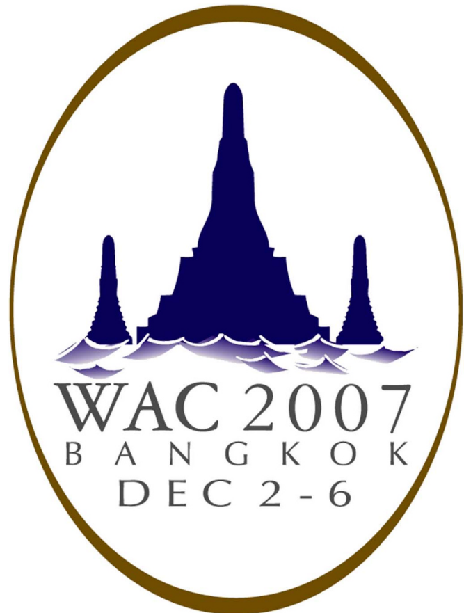
FIGURE 11. Logo of the XX World Allergy Congress, Bangkok, Thailand, in 2007.