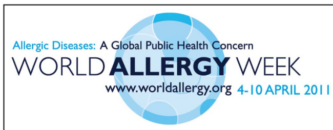
FIGURE 6. Logo of the World Allergy Week 2011 initiative of the World Allergy Organization.

It was at the congress in Sydney in 2000 that the House of Delegates reviewed and approved the overall concepts