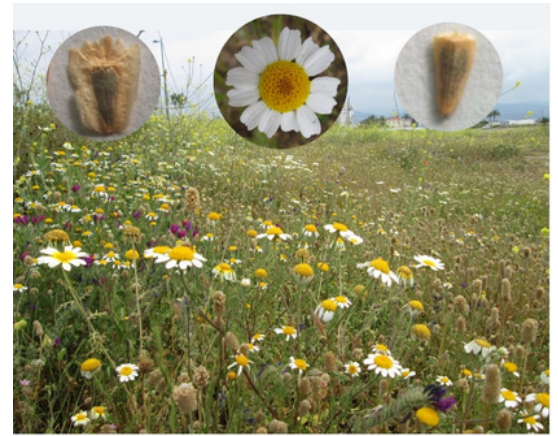
Rubén Torices et al. 2024. Fruit wings accelerate germination in Anacyclus clavatus . American Journal of Botany https://doi.org/10.1002/ajb2.16272

Names for specific traits that suggest a particular function can sometimes be misleading when it comes to the actual roles of those traits. For example, many species produce fruits with lateral expansions, commonly referred to as ‘wings’, which are thought to enhance dispersal. However, several species with winged fruits are small statured, limiting the dispersal distances of these fruits. Do these wings serve another function? The annual weed Anacyclus clavatus , a composite species found around the Mediterranean Basin, produces both winged and unwinged fruits—providing a unique opportunity to investigate alternative functions of wings. Torices et al. hypothesized that wings could enhance germination by increasing the contact surface with water compared to that of unwinged fruits. Their results showed that winged fruits, after they are released from their mother plants, germinate faster than unwinged fruits. They found that winged fruits absorbed water more quickly and in greater quantities than unwinged fruits. Additionally, they showed that sealing the wings to prevent water uptake delayed germination. These findings support the idea that wings can serve functions beyond dispersal.