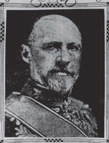
SIR CECIL ARTHUR SPRING-RICE, K. C. M. G., the new British ambassador to the United States, who succeeds James Bryce, who has been minister in Washington since 1905.

The new British ambassador to the United States, who succeeds James Bryce, who has been minister in Washington since 1905, is Sir Cecil Arthur Spring-Rice, K. C. M. G.