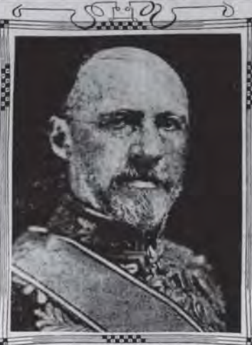
SIR CYRIL ARTHUR SPRING, NEW BRITISH AMBASSADOR TO THE UNITED STATES.

The new British ambassador to the United States, Sir Cyril Arthur Spring, was introduced to the press today in a formal ceremony at the State Department.