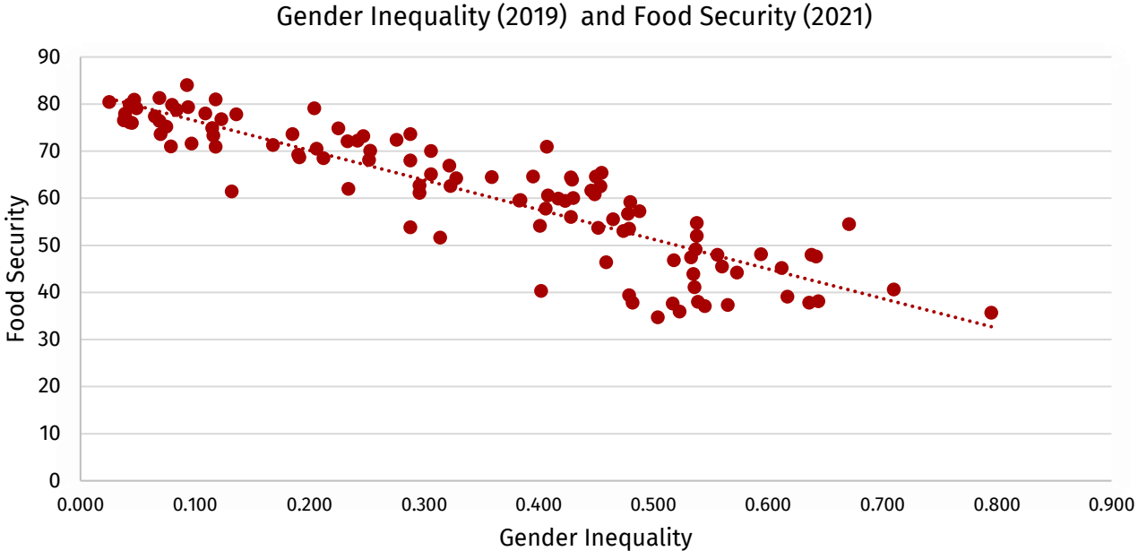
Graph 1: The Gender Inequality Index by the Human Development Report (2019) and Food Security Score by The Economist (2021).

The graph shows a negative correlation, meaning that as one variable increases (gender inequality) the other variable decreases (food security) , with a correlation coefficient of -0.89 showing a fairly strong negative relationship between the two variables. An adjusted r-squared value of 0.78 shows that 78% of the variability observed in the target variable is explained by the regression model. This same analysis with the 2019 food security scores from The Economist and the previously mentioned 2019 gender inequality index, showing a similar result. This is that as gender inequality decreases food security increases . The regression was also done with the SIGI 2019 scores for gender inequality and the food security scores from 2021, showing a similar result among 87 countries.