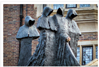
A house called Sarum Chase in Hampstead.

Jewish community in shock over rabbi's condemnation of child abuse cover-up.