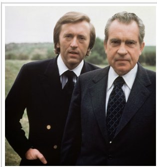
Sir David Frost (left)