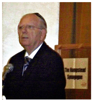
Efraim Halevy, former Head of the Mossad, in Hampstead.

Hampstead is the fictional location of Lucy Westenra 's tomb in Bram Stoker's novel Dracula . Lucy lured children to Hampstead Heath at night to drink their blood. During the course of their investigation, Drs. Van Helsing and Seward dined at Jack Straw's Castle and caught a cab near Spaniards Inn .