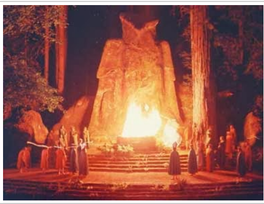
'Satanists' at Bohemian Grove in California.

Satanic child abuse is widespread and often the police are involved in the cover-up.