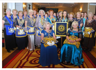
Hampstead is home to a lot of the top people in the UK. The Honourable Fraternity of Ancient Freemasons (HFAF) in Hampstead.