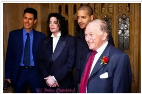
Yuri Geller, Michael Jackson, and (right) Greville Janner

Reportedly a Satanic child abuse ring operates in Hampstead.