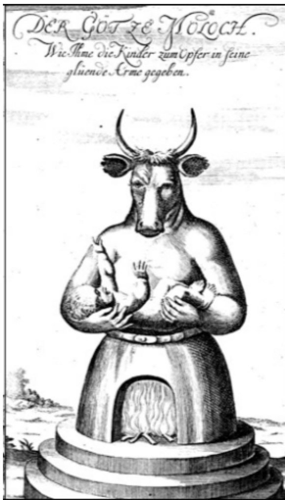
Classic Moloch illustration with baby

There are very good reasons why Hebrew Patriarch Abraham of the Old Testament was quite willing to sacrifice his son Isaac 'living god'. Obviously such a bizarre and ungodly request would never be made by the one true God. It was more likely a command issued by God only knows who. Which points to a very powerful demonic entity who at that time presented itself 'Almighty' and 'Supreme Being'.