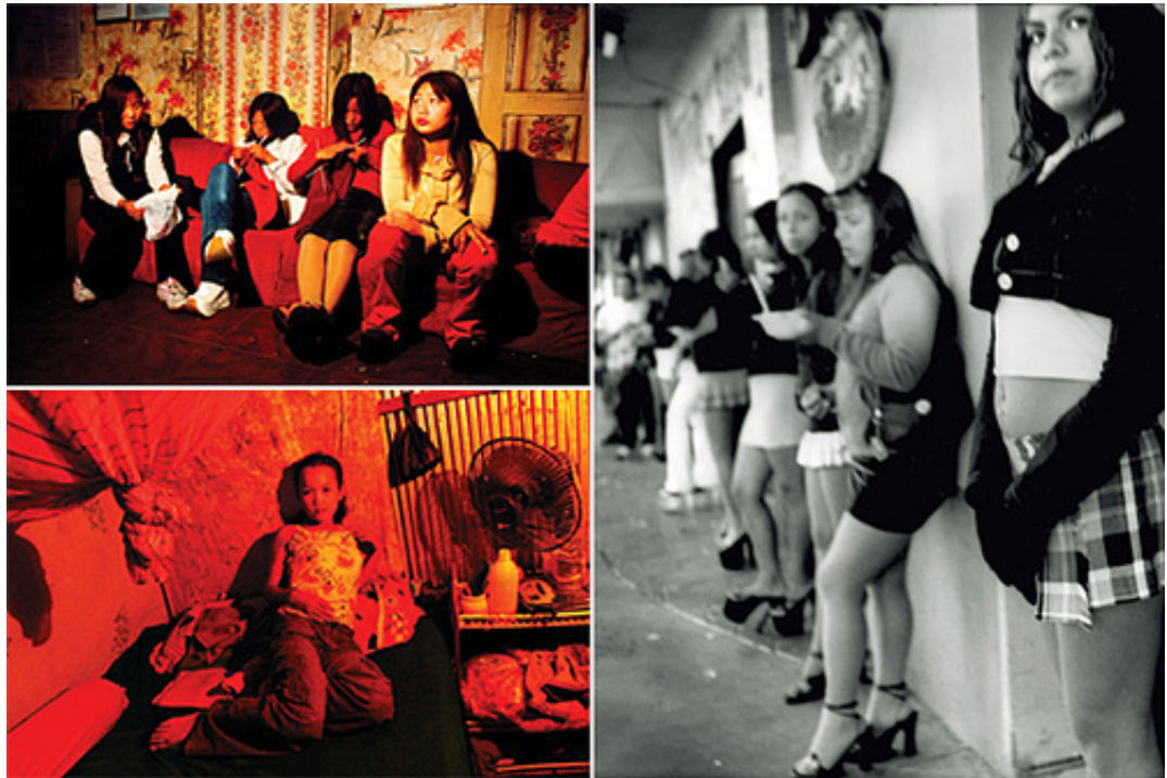
Child sex slaves

The unfortunate consequence is that children are now being kidnapped at an alarming rate by professional kidnapers who are after money for young and healthy human beings. Some children are even abducted by family or friends who are drawn into such sometimes unwittingly so convoluted are the plots. The true missing children statistics, along with in-your-face kidnappings, is an ominous trend. It has never been so dangerous being a child given that some corporate bottom lines are now being inflated by children.