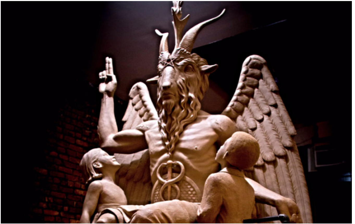
Statue of Baphomet with children

When the Bavarian Illuminati was first established, their members were men who eventually rejected the right path back to the gods. Instead, they chose the left path which embraced all sorts of occult practices, demonic rituals and left-handed protocols in order to reach their various idols. The most worshipped of these idols are known as Moloch and Baphomet, both of which are crude representations of Saturn. That's why the "Sabbatic Goat" image is often used as a satanic symbol. The mountain goat is also the zodiac symbol for Capricorn—the astrological sign ruled by Saturn.