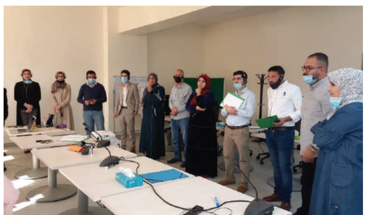
Organizational development in the Water Training Center