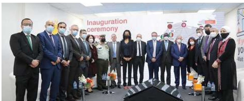
Participants, including governmental and administrative authorities from Jordan, representatives of Germany and France in Jordan, GIZ Jordan as implementing partner, and Orange CEO Stéphane Richard, pose for a group photo during the launch of the 'Orange Digital Center'.