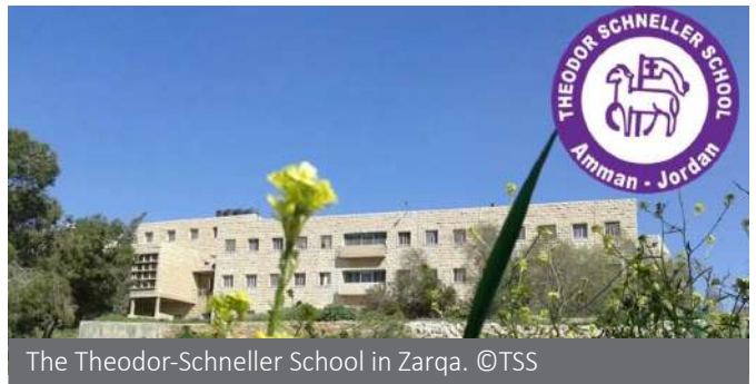
The Theodor-Schneller School in Zarqa.

At a virtual multi-stakeholder workshop of the Theodor-Schneller School (TSS), which was supported by the GIZ Skilled Crafts project, TSS board members, teachers, students and donor organisations discussed ideas for future development of the school. In an introductory exercise, the participants developed headlines of the future for the front page of a fictitious special newspaper for 2025. This helped creating a shared understanding of the participants' vision of future success for the TSS. Building on this exercise, the participants formulated recommendations for actions on educational, ecological, and financial levels, including the vocational training section.