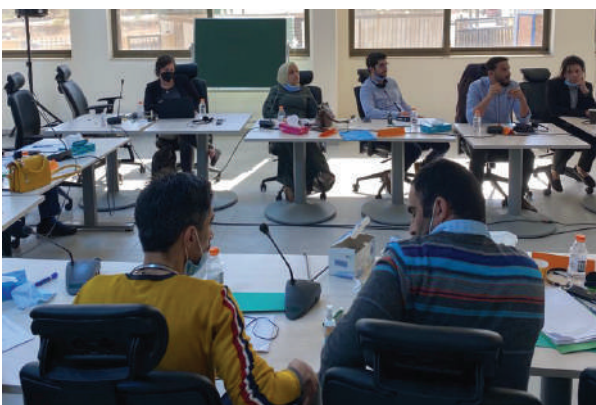
A special attention will be given to the possibility of digitizing the processes as well as the development of digital training contents.

The Water Training Center (WTC), operated under the umbrella of the Water Authority of Jordan, is foreseen to serve as a training center for the Jordanian water sector in general. Construction works are finalised, and different types of trainings are already being conducted. However, there is space for improvement in the standard processes to run the center efficiently. The GIZ project WTR supports the team of the WTC through consulting on organizational development and aims to develop and anchor sustainable processes in order to contribute to institutionalization in the long-term. This includes management processes, as well as training and support processes. The organizational development will be implemented through blended learning approach including face-to-face workshops and online coaching.