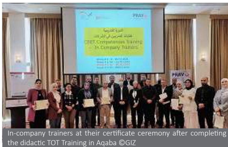
In-company trainers at their certificate ceremony after completing the didactic TOT Training in Aqaba

A series of didactic TOT workshops were organised in Amman and Aqaba, with the support of JLA and NSSC Logistics. The workshops were designed to build the capacities of in-company trainers as they will be actively participating in delivering training at different vocational and technical institutions.