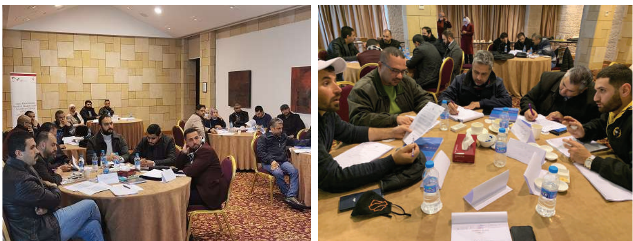
Participants during the workshop on the 5E methodology: Engage, Explore, Explain, Elaborate, and Evaluate.

Based on the request from the Ministry of Education and in light of the successful curricula development on 5E's methodology, the MOVE-HET project within the KOICA co-finance supported further the development of a training programme on the 5E methodology. In a 5 days training workshop, 24 industrial teachers from different governorates around the kingdom got familiar with the special methodology.