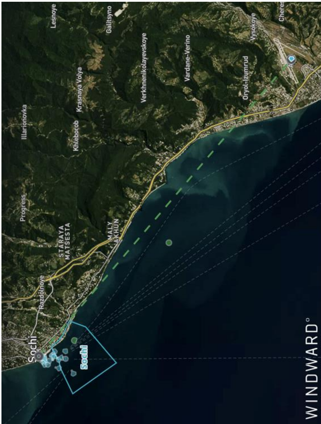
Vessel at Sochi Harbor Reporting Itself at Sochi Airport. Windward Ltd is willing to provide raw data to journalists wishing to construct their own graphics of other spoofing incidents..