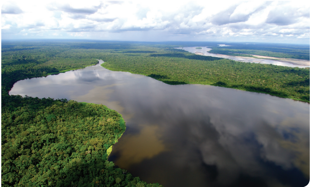
Orellana Province, Ecuador

“The message our Living Forest proposal delivers is aimed at the entire world with the goal of reaching the hearts and minds of human beings everywhere, encouraging us all to reflect on the close relation between Human Rights and the Rights of Nature.” From Kawsak Sacha, The Living Forest: An Indigenous Proposal for Confronting Climate Change, presented by the Amazonian Kichwa People of Sarayaku, Ecuador