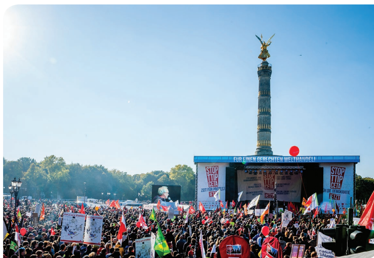
CETA protests in Berlin, 2015

Modern free trade agreements, unlike those of the past, are less about taking down barriers to the trade in goods and more about challenging what are called “non-tariff barriers” - rules and regulations that protect, among other things, water, forests, soil and air. Free Trade Agreements such as CETA, the Canada-EU Comprehensive Economic and Trade Agree-