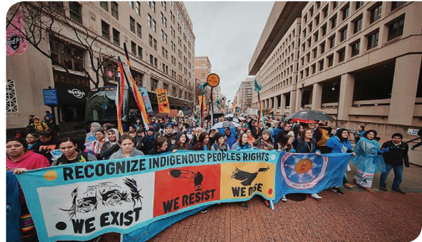
Native Nations Rise March

Our first environment is water. We live in water throughout gestation inside our mother who then gives birth through water - Mni Wiconi