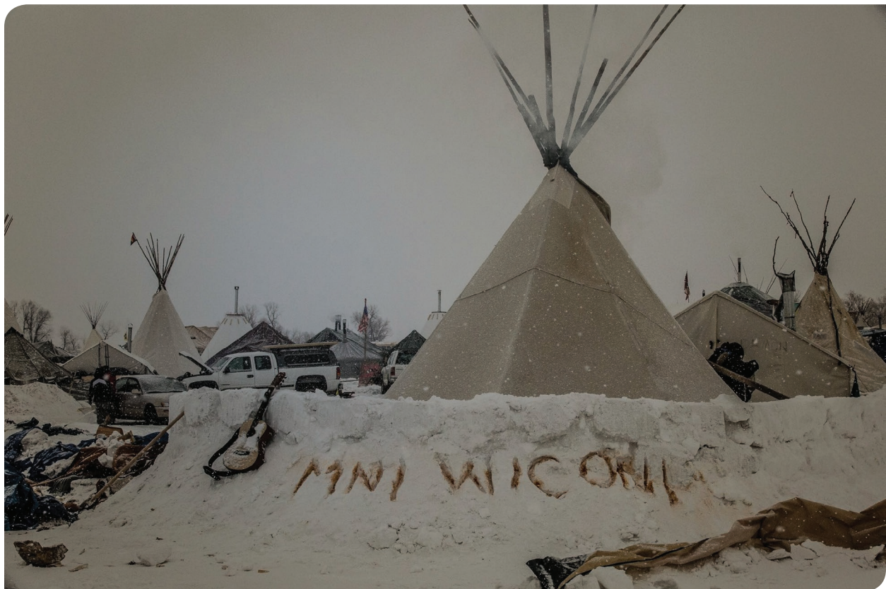
“0 Degrees. We’re Still Here” Oceti Sakowin Camp