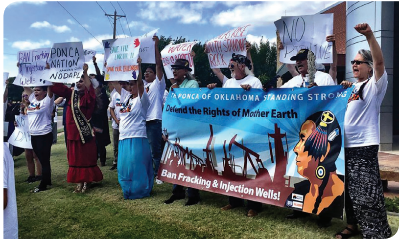
The Ponca Tribe of Oklahoma will pass rights of nature into tribal law by December 2017.