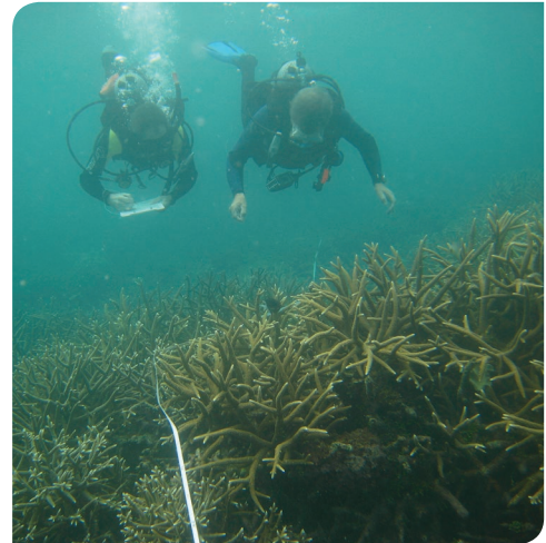
Scientists study the deterioration of the Great Barrier Reef

However that perspective overlooks the fact that judgements such as this provide an example of what kind of judgement is possible and thereby expose the inadequacies of existing legal systems in the face of challenges like climate change. The Tribunal demonstrates that if international and national judicial bodies decided cases involving the critical challenges of the 21 st Century in the same way as the Tribunal does, then law could make a far more significant contribution to addressing climate change that it does now.