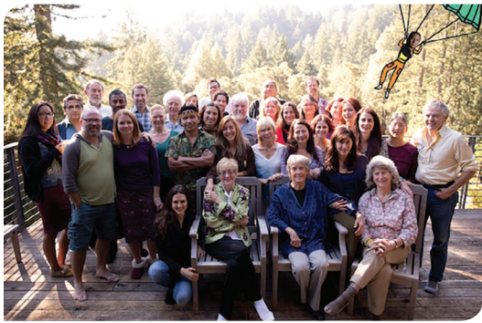
Participants at the Stillheart Institute

In October 2013, on Ohlone Indigenous land, Global Exchange and partners held a 3-day summit at the Stillheart Institute in Woodside, California. Nestled in the California Redwood forest a counsel of 32 global social movement leaders including Indigenous leaders, deep ecologists, grassroots justice advocates, economists, climate experts, localization activists, globalization thinkers, writers and researchers were convened to examine the emerging legal framework known as Rights of Nature, or Rights of Mother Earth. This declaration emerged and is affirmed by the undersigned participants.