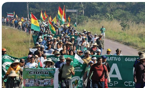
Bolivia: Indigenous peoples mobilize against highway through the rainforest

On August 15th, 2011, around one thousand Indigenous people of the lowlands of Bolivia started in the city of Trinidad the “Eight March of Indigenous people” in defense of TIPNIS. The march was dismissed by the government from the beginning. When it arrived the 25th of September to the locality of Chaparina five hundred policemen intervened violently and dissolved the march detaining hundreds of people.