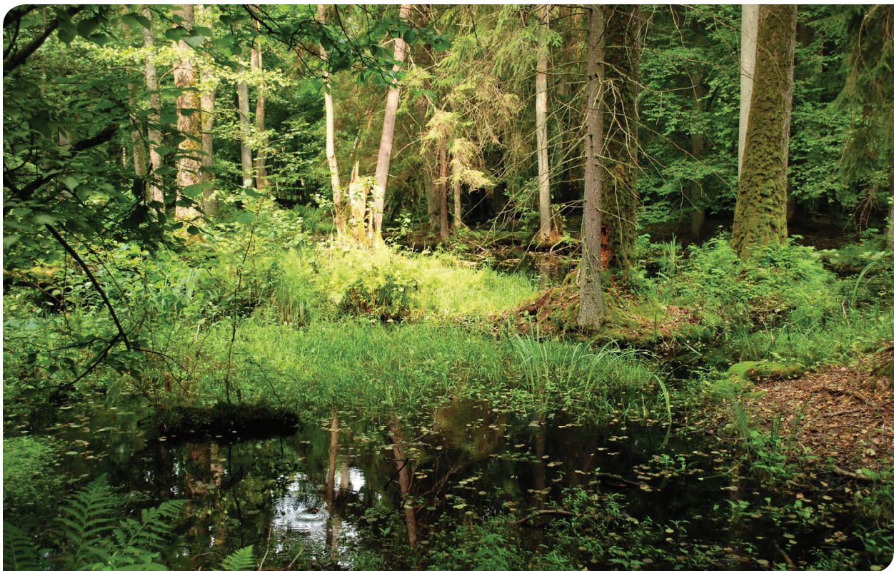
Białowieża Forest in Poland